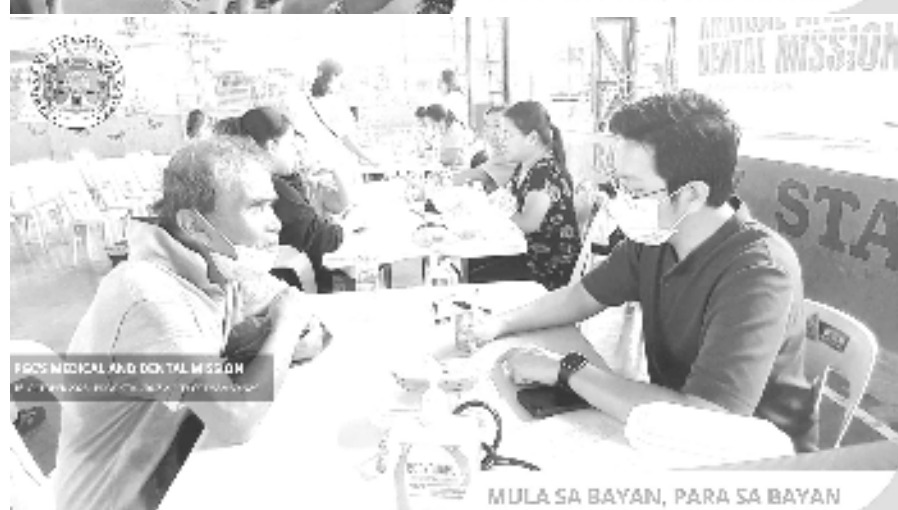
MULA SA BAYAN, PARA SA BAYAN

The Provincial Government of Cavite (PGC), through the office of the Provincial Governor in partnership with the Office of the Provincial Health Officer