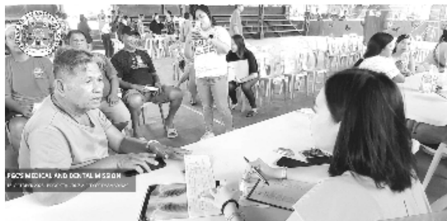
MULA SA BAYAN, PARA SA BAYAN