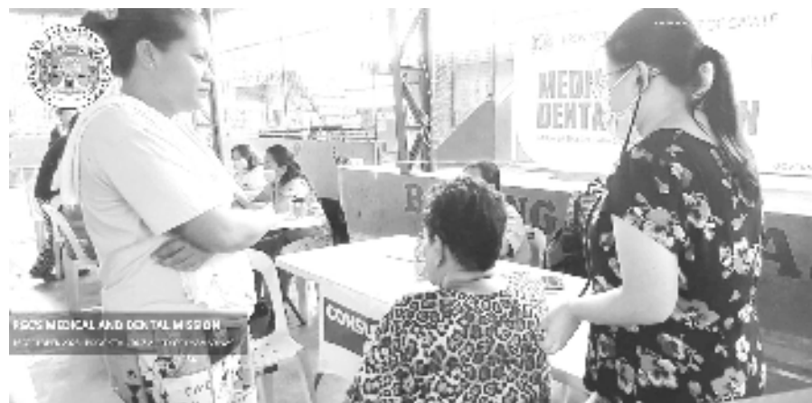
MULA SA BAYAN, PARA SA BAYAN