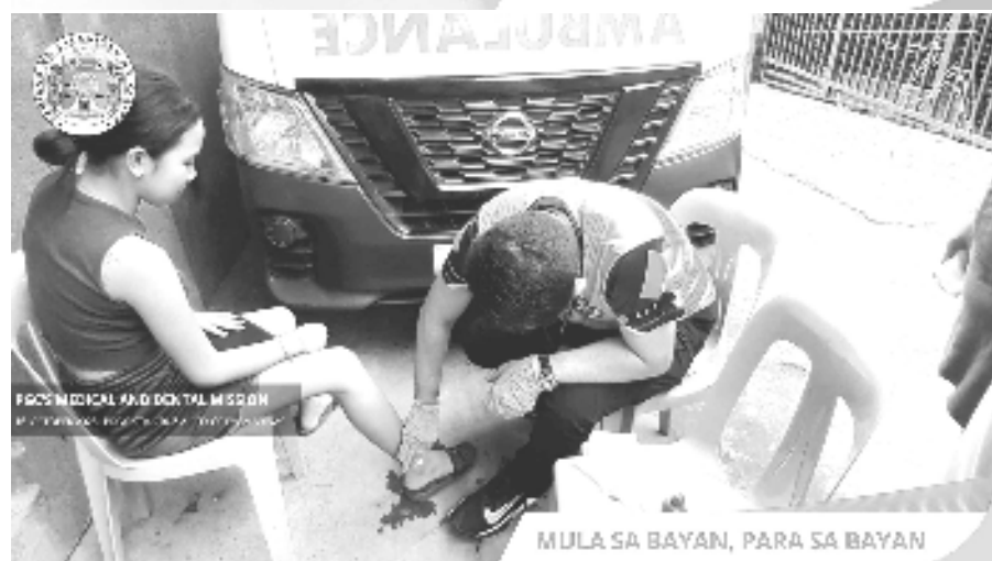
MULA SA BAYAN, PARA SA BAYAN