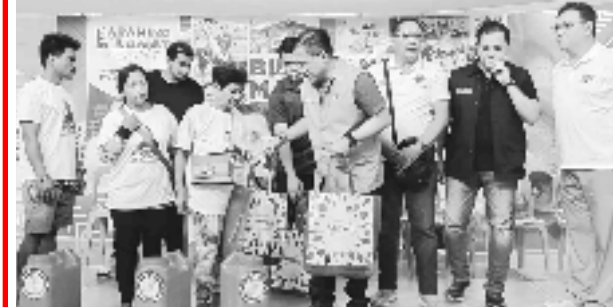
Senator Christopher Lawrence "Bong" Go personally led the distribution, yesterday, September 13, 2024, of relief packs to more than 930 families who were the fire victims in Sitio Wawa, Barangay Zapote 3 in Bacoor City. Senator Go and city officials led by Mayor Strike Revilla personally provided Integrated Disaster Shelter Assistance Program (IDSAP) financial assistance per family in collaboration with the Department of Human Settlements and Urban Development (DHSUD)., MARGIE BAUTISTA