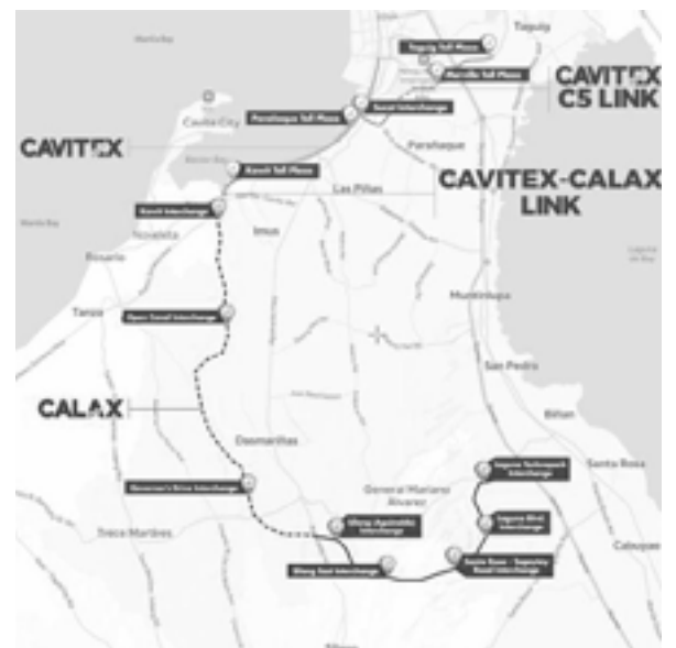
CALAX Road Network Map: CALAX Road Map (Operational from Laguna technopark interchange to Silang Aguinaldo; Under construction from Silang Aguinaldo to Kawit Interchange)

For inquiries regarding this press release, you may reach us at corpcomm@mptsouth.com