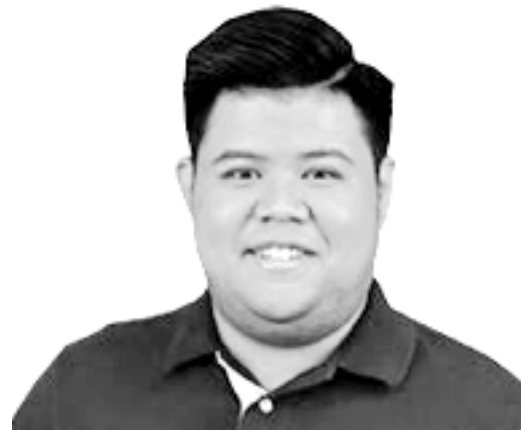
Cong. Adrian Jay 'AJ' Advincula 3rd District of Cavite