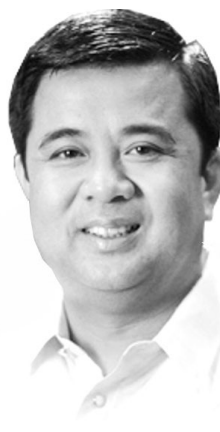
Mayor Alex "AA" Advincula Imus City, Cavite