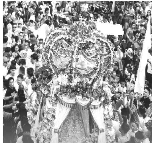
Dinagsa ng libu-libong deboto ang bayan ng Rosario upang makiisa sa