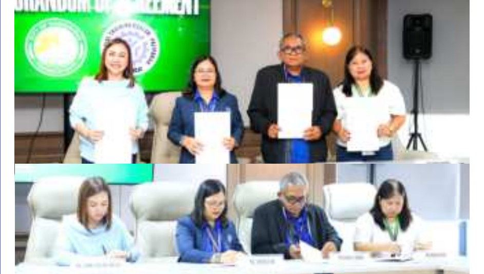
MOA Signing with TESDA Provincial Training Center for the use of its training facilities located at Barangay Langkaan II and Barangay Sabang, City of Dasmariñas for the conduct of various training programs intended for the residents of the city.