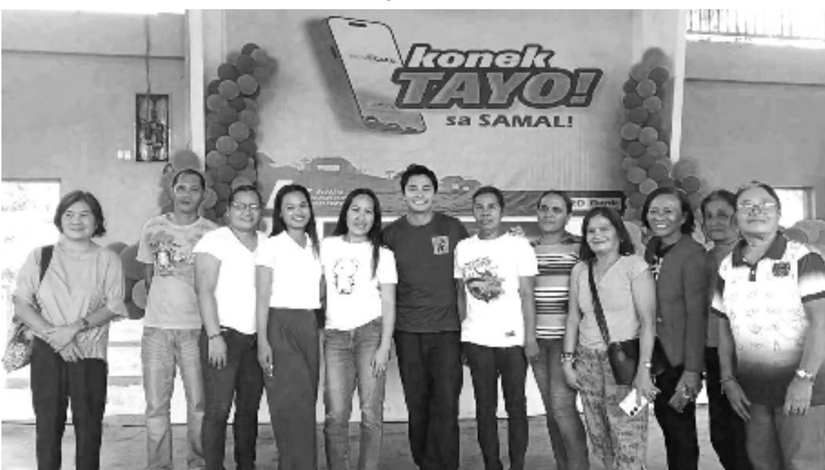
CARD Bank clients took part in the konekTAYO event in Samal, along with the konek2CARD brand ambassador, Mr. JC Santos.

On April 18, 2026, the first konekTAYO 2026, attended by 462 CARD Bank clients, was held at the New Kaputian Gymnasium, Purok Tower, Poblacion Kaputian, Samal, Davao del Norte.