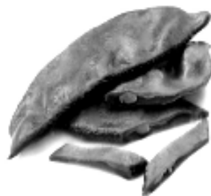
Scientific name: Dolichos lablab Linn.; Dolichos purpureus L. Common name: Bataw (Tagalog); Hyacinth Bean, Lablab bean (Ingles)

Ang bataw ay isang gumagapang na halaman na kilala dahil sa bunga nito na ginagawang gulay. Ang mga dahon at bunga ay bahagyang mamula-mula, habang ang bulaklak naman ay maputi at bahagyang kulay lila o pink. Karaniwang pananim sa mabababang lugar sa Pilipinas.