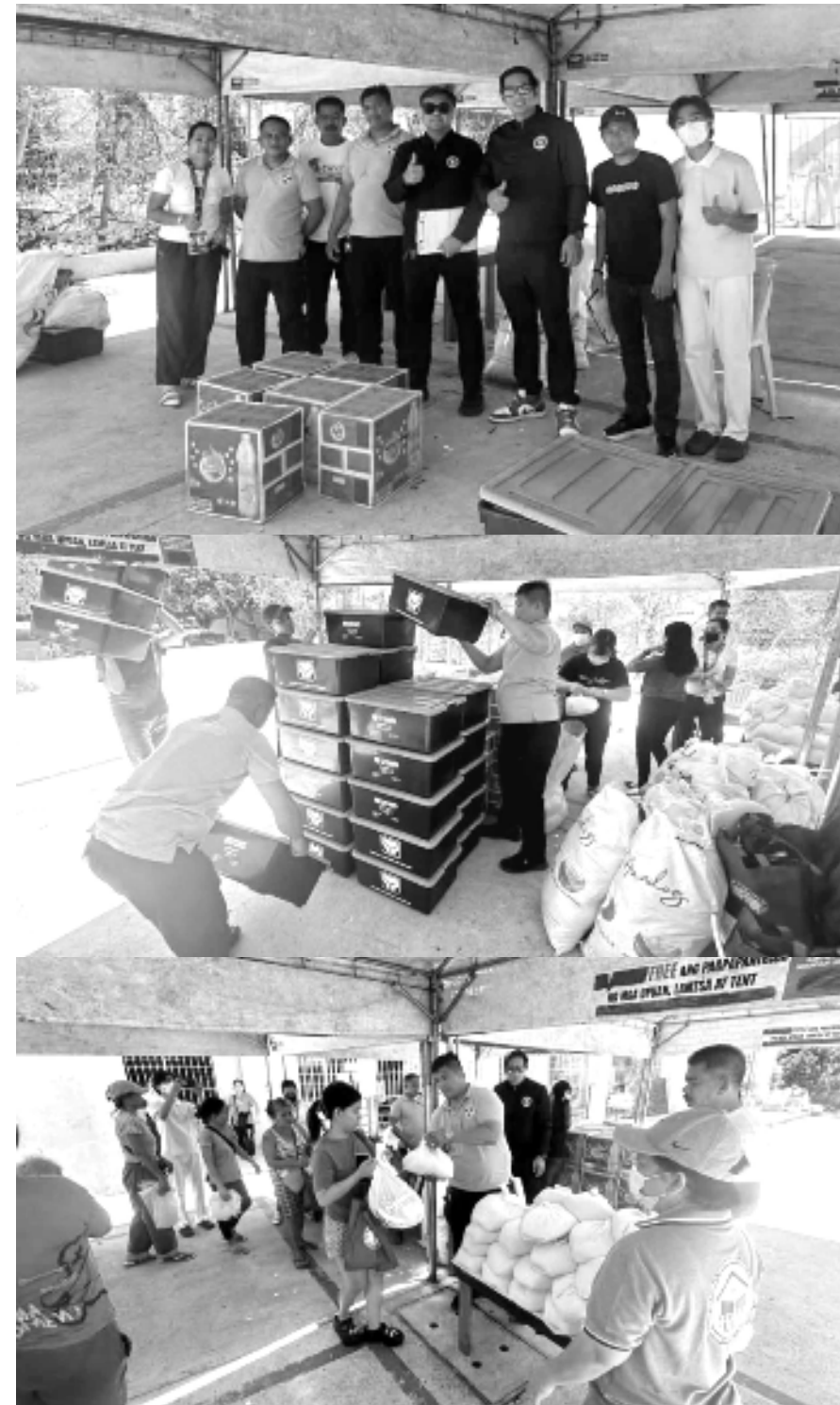
PhilHealth YAKAP Caravan for Multisectoral groups... from page 8

The Local Health Insurance Office (LHIO) Dasmariñas successfully conducted a PhilHealth YAKAP Caravan for Multisectoral groups at Phase 2B Covered Court, Bahayang Pag-asa Subdivision, Brgy. Molino V, Bacoor City, Cavite on April 11, 2026.