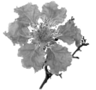
Scientific name: Lagerstroemia speciosa (L.) Pers.; Lagerstroemia reginae Roxb.; Munchausia speciosa (L.) Common name: Banaba (Tagalog), Queen's Flower o Pride of India (Ingles)

Ang banaba ay isang namumulaklak na puno na kilala sa maraming lugar sa Pilipinas. Ang bulaklak ay kulay lila at bumubuka nang malapad. Ito ay may bunga na mala mala-ubas ngunit kulay tsokolate. Karaniwan itong tumutubo sa isla ng Luzon, pati na sa Mindanao at Palawan. Dahil nga sa kakayanan nitong makagamot ng ilang mga karamdaman, kalimitan ding mabibili ang banaba na nakahanda bilang inuming tsa at tableta.