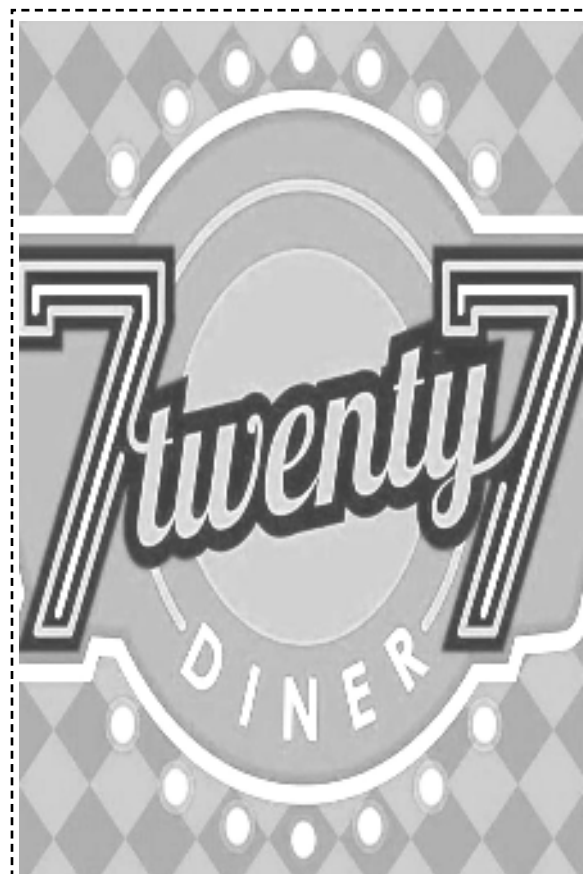
SEE YOU AT GEN. E. TOPACIO ST. NEAR THE TOPACIO COMPOUND IMUS, CITY

from page 5 component of DOLE's youth employment initiatives designed to provide opportunities for young individuals to gain meaningful work experience in government agencies. Through the program, interns are exposed to actual workplace settings where they can develop their skills, enhance their employability, and gain a deeper understanding of public service. The GIP also serves as a bridge for fresh graduates and out-of-school youth to transition into the workforce while contributing to nation-building. The Provincial Government of Cavite expressed its continued support for programs that empower the youth and create employment opportunities, reinforcing its commitment to developing a competent and service-oriented workforce for the future.--- OPIO