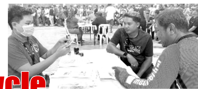
The DSWD Field Office IV-A has already distributed a total of Php455.49M as cash relief assistance to 91,097 tricycle drivers in the CALABARZON Region as of April 17, 2026, 5:00 PM.