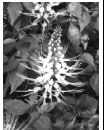
Scientific name: Orthosiphon aristatus (Blume) Miq.; Orthosiphon stamineus Benth. Common name: Balbas Pusa (Tagalog); Cat's Whisker, Java Tea (Ingles)

Ang balbas pusa ay isang halamang ornamental na may katamtamang taas lamang. Pinaka kilala ito dahil sa bulaklak na may mahaabang bahagi na nagmistulang balbas ng pusa. Karaniwan ito sa mabababang lugar sa Luzon at Palawan, pati na rin sa bansang India, Malaysia at Australia. Ang dahon nito ay karaniwang ginagawang tsaa sa maraming lugar. Ano ang mga sustansya at kemikal na maaaring makuha sa Balbas Pusa?