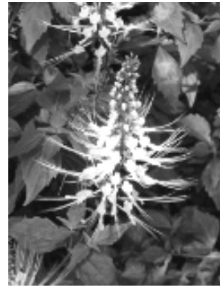
Scientific name: Orthosiphon aristatus (Blume) Miq.; Orthosiphon stamineus Benth.

Ang balbas pusa ay isang halamang ornamental na may katamtamang taas lamang. Pinaka kilala ito dahil sa bulaklak na may mahabang bahagi na nagmimistulang balbas ng pusa. Karaniwan ito sa mabababang lugar sa Luzon at Palawan, pati na rin sa bansang India, Malaysia at Australia. Ang dahon nito ay karaniwang ginagawang tsaa sa maraming lugar. Ano ang mga sustansya at kemikal na maaaring makuha sa Balbas Pusa?