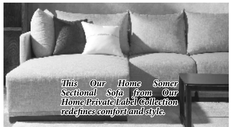
This Our Home Somer Sectional Sofa from Our Home Private Label Collection redefines comfort and style.