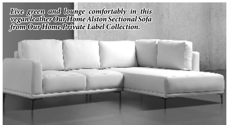
Live green and lounge comfortably in this vegan leather Our Home Alston Sectional Sofa from Our Home Private Label Collection.