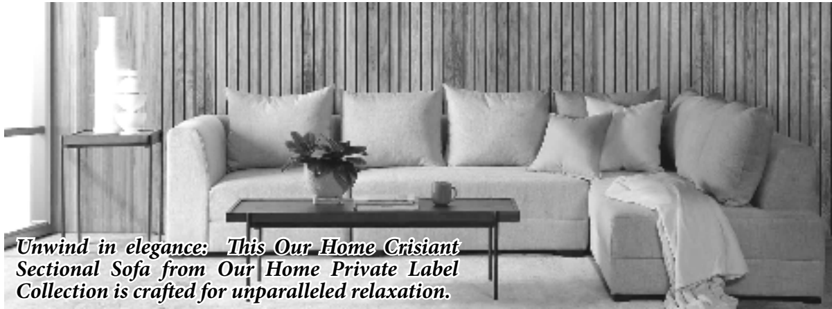
Unwind in elegance: This Our Home Crisiant Sectional Sofa from Our Home Private Label Collection is crafted for unparalleled relaxation.