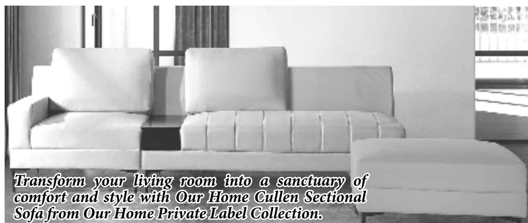
Transform your living room into a sanctuary of comfort and style with Our Home Cullen Sectional Sofa from Our Home Private Label Collection.