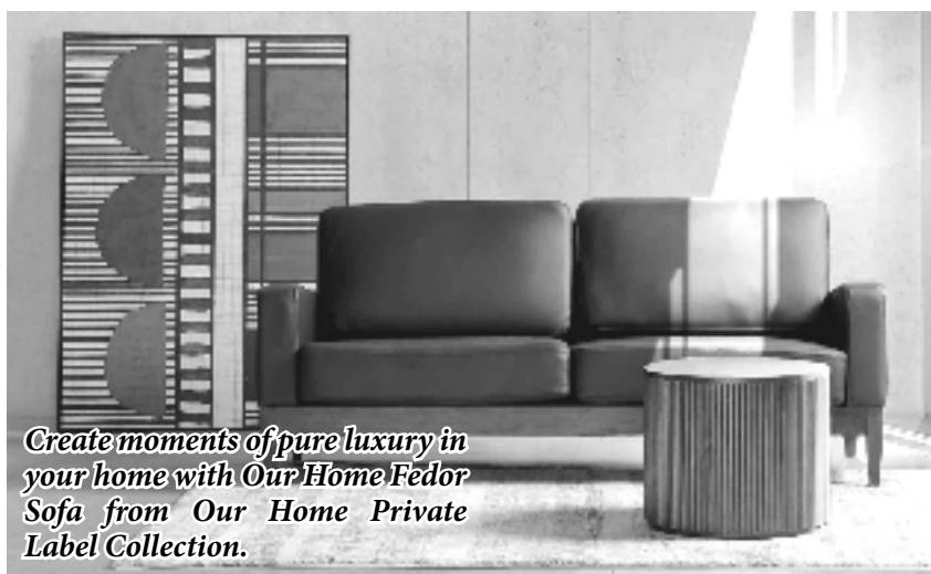
Create moments of pure luxury in your home with Our Home Fedor Sofa from Our Home Private Label Collection.