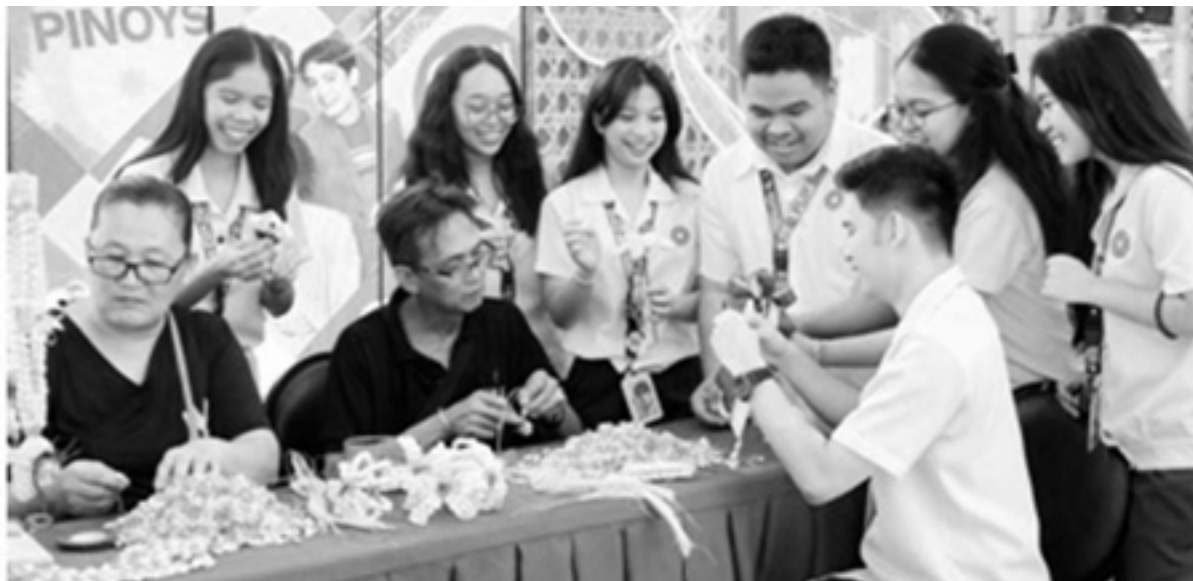
Students of the Polytechnic University of the Philippines - San Pedro experience the art of garland making at SM Center San Pedro.

This Independence Day, SM Center San Pedro joins forces with the local government to breathe new life into San Pedro City's renowned Sampaguita industry. The Philippines' national flower has long been a source of livelihood for San Pedrenses, and SM Center San Pedro's initiative aims to empower local Sampaguita makers and