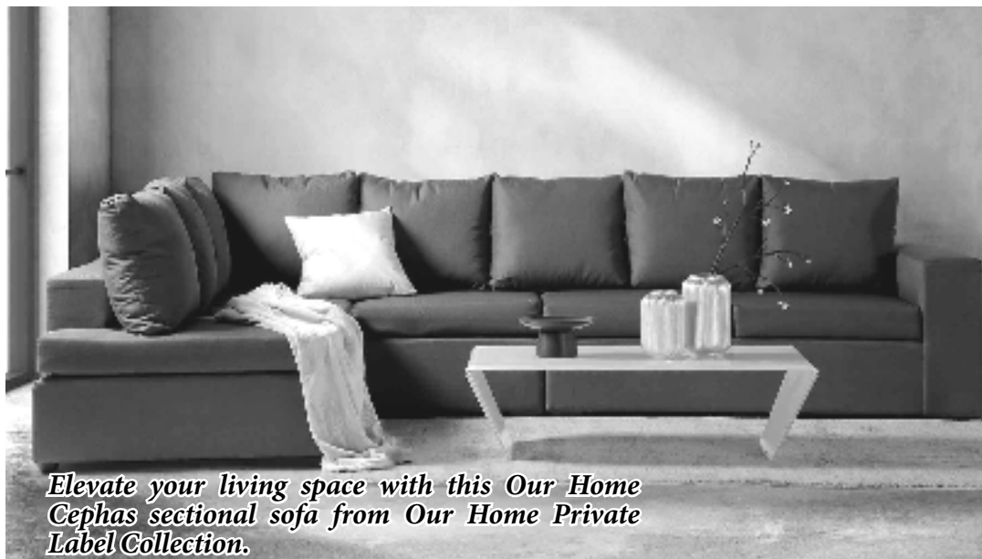
Elevate your living space with this Our Home Cephas sectional sofa from Our Home Private Label Collection.