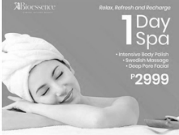
Mother's Day is unwind, refresh, and pamper yourself kind of day! Treat your mom to a day of pure relaxation with Intensive Body Polish, a soothing Swedish Massage, and a rejuvenating Deep Pore Facial from Bioessence SM City Calamba!

Hey SuperFam! Get ready to show some love to the most important woman in your life this Mother's Day at SM Supermalls.