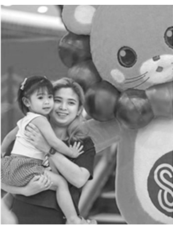
Playtime with Mom: Making Memories at the Playscape