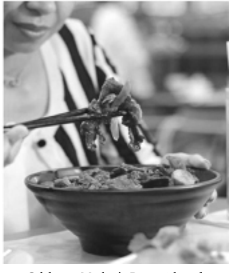
Celebrate Mother's Day with a feast of sumptuous meals only at Modern Shanghai SM City Santa Rosa