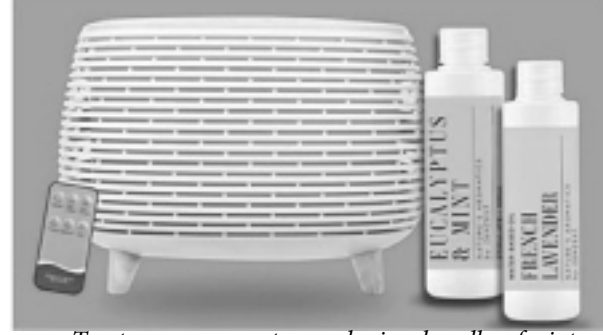
Treat your moms to a relaxing bundle of vintage humidifier & fragrance blend only from Surplus SM City San Pablo and SM City Santa Rosa

delicious group meals and promotions at participating restaurants cafes. Because nothing says "I love you, Mom" like good food and quality time!