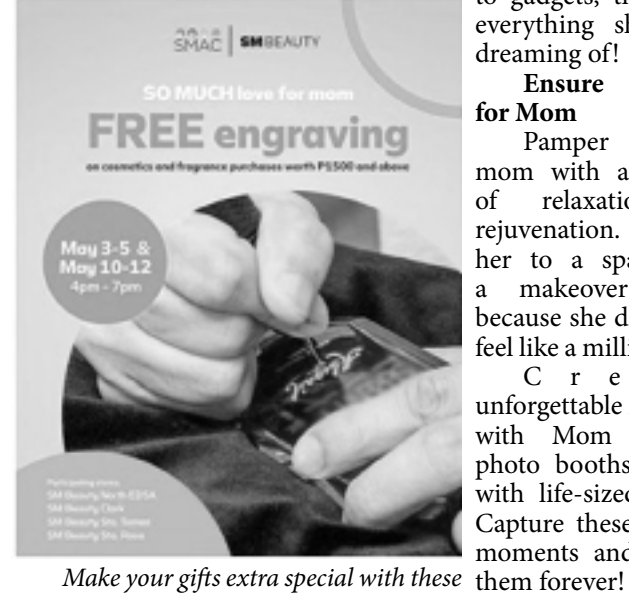
personalized perfumes and cosmetics.

playscape offer numerous opportunities for shared experiences. it's capturing Whether moments at their Instagramworthy spots or interacting with Roary the Lion while exploring the playscape together, these activities promise a delightful time. Such shared experiences not only create cherished memories but also nurture a deeper sense of closeness and understanding between the children and their supermoms.