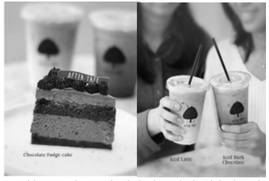
Indulge in an Iced Latte, Iced Dark Chocolate, and a slice of Chocolate Fudge cake, all for just P499. Celebrate your special bond at After Tree Dessert Café SM City Santa Rosa and SM Center San Pedro