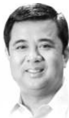
Mayor Alex "AA" Advincula Imus City, Cavite