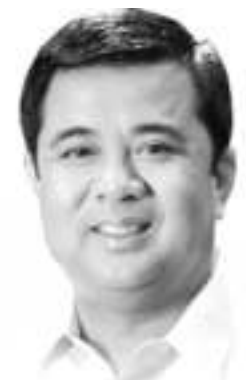
Mayor Alex "AA" Advincula Imus City, Cavite