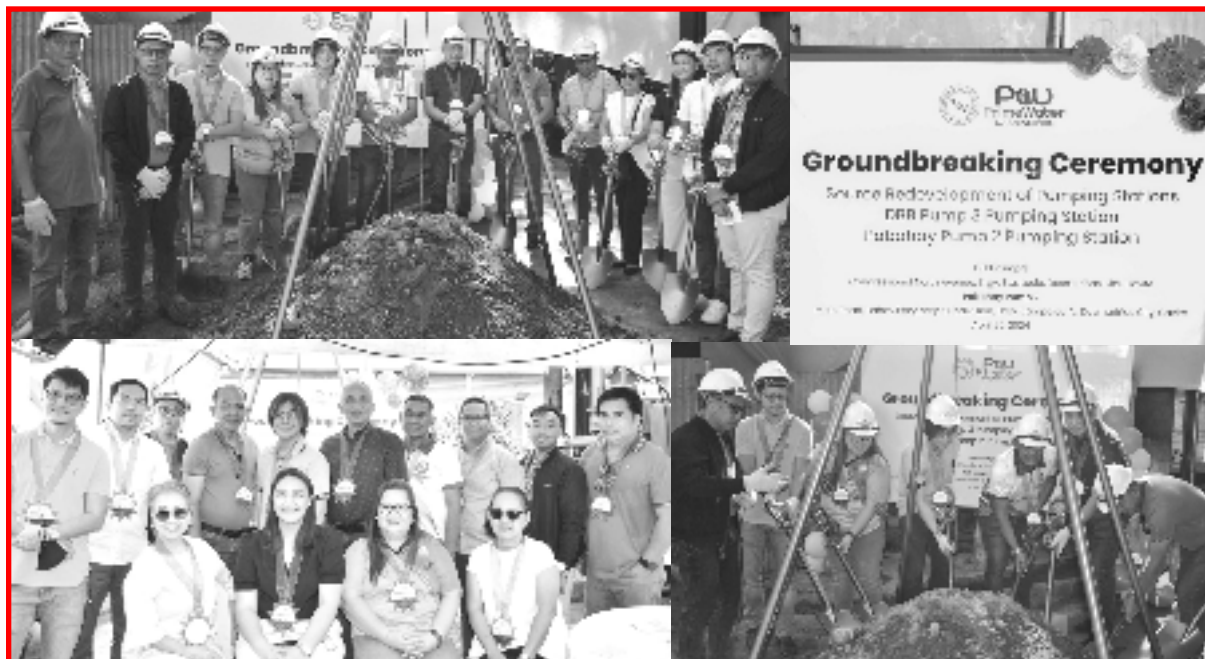
Groundbreaking Ceremony of the Source Redevelopment Pumping Stations, Pabahay Pump 2 Pumping Station and DBB Pump 3 Pumping Station of Prime Water Dasmariñas and Dasmariñas Water District attended by Third Barzaga.

wala pang limang taong gulang laban sa nasabing sakit. PIA CAVITE