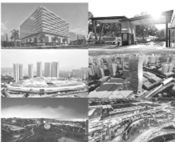
From Left to Right, Top to Bottom: Lanson Place, SM Development Corporation (SMDC) Turf Residences, SM City Yangzhou in China, SM Mega Tower, SM Mall of Asia Complex, and SM City North EDSA

The outstanding performance can be attributed to SM Prime's mall business, driving 56% of consolidated revenues and a 30% growth to PHP71.9 billion in 2023. This growth was bolstered by a 24% increase in mall