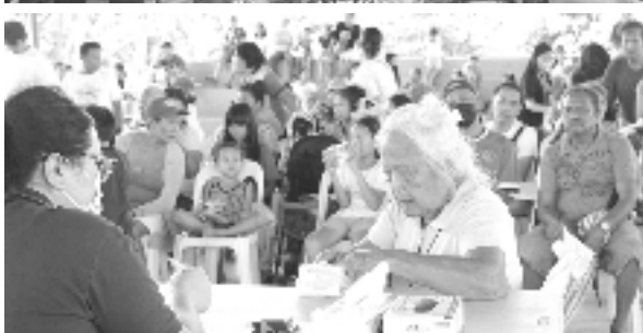
Muling nagsagawa ang Pamahalaang Lungsod ng Pay out para sa Social Pension para sa mga Senior Citizen. Kasabay din nito ay pinangunahan ng City Health Office ang medical at dental mission ng (cont. P.6)