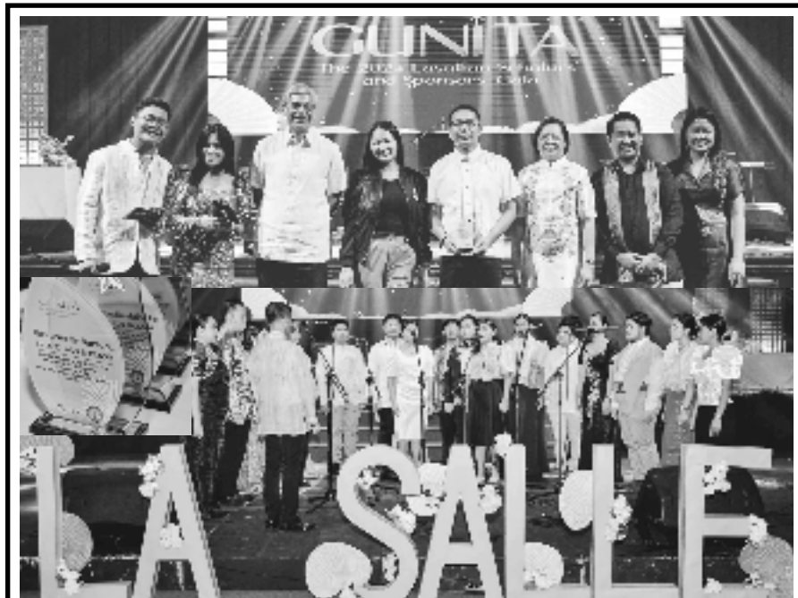
Gunita: 2024 Lasallian Scholars and Sponsors Gala was held last April 19, 2024 at De La Salle Animo Center to show appreciation and honor the sponsors who have consistently helped the scholars of De La Salle Medical and Health Sciences Institute pursue their academic goals in medical field