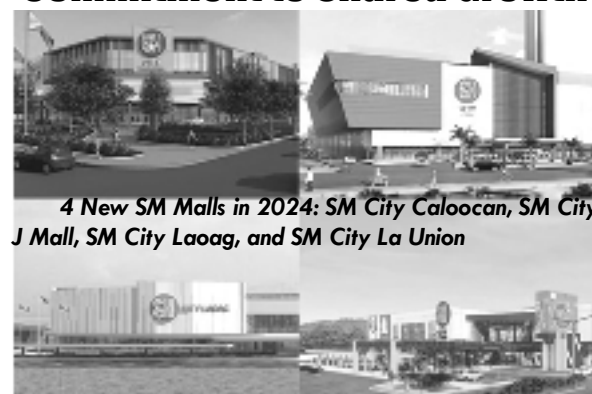
4 New SM Malls in 2024: SM City Caloocan, SM City J Mall, SM City Laoag, and SM City La Union

At the core of SM Prime's success is its unwavering commitment to shared prosperity in every city where they are