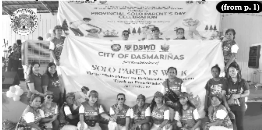
(from p. 1)