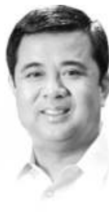
Mayor Alex "AA" Advincula Imus City, Cavite