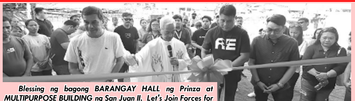
Blessing ng bagong BARANGAY HALL ng Prinza at MULTIPURPOSE BUILDING ng San Juan II. Let's Join Forces for a More Progressive City of General Trias!