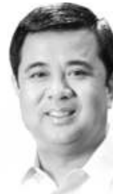
Mayor Alex "AA" Advincula Imus City, Cavite