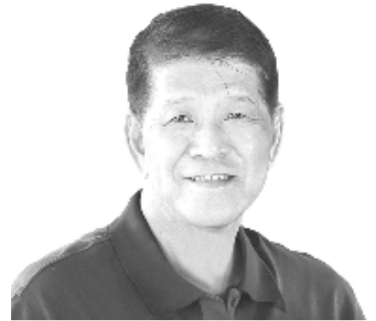
VICE-MAYOR HOMER SAQUILAYAN Imus City, Cavite

Vol. VIII No.06 January 8-14 2024 P 10.00 ISSN No.: 2672-3034