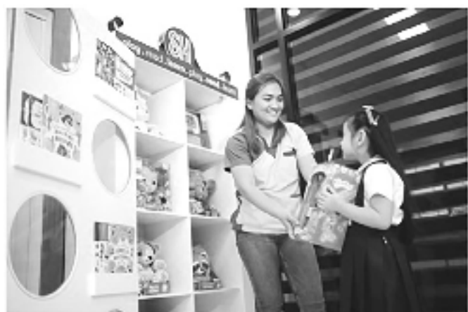
The center features a mobile play cabinet with gender-neutral toys to nurture comfort and promote coping in the face of illnesses.

The rainwater catchment system helps lessen the center's reliance on municipal sources and contribute to water conservation efforts.