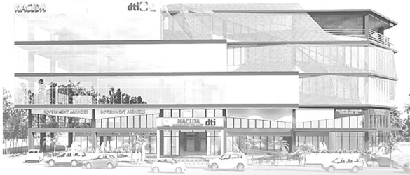
SOON TO RISE NACIDA INCUBATOR FACILITY TO SERVICE MSMEs IN MARIKINA CITY

MARIKINA CITY—a year after its groundbreaking ceremony, the Marikina City NACIDA Incubator Facility Building is taking shape, as the Department of Public Works and Highways Metro Manila 1st District Engineering Office