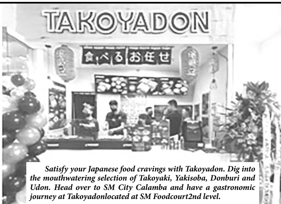
Satisfy your Japanese food cravings with Takoyadon. Dig into the mouthwatering selection of Takoyaki, Yakisoba, Donburi and Udon. Head over to SM City Calamba and have a gastronomic journey at Takoyadon located at SM Foodcourt 2nd level.