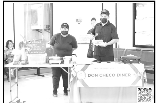
Isinagawa ang pangalawang programa ng Making Sustainable Business Reachable sa Main Lobby, Bacoor Government Center na may layuning masuportahan ang local entrepreneurs sa ating Lungsod.