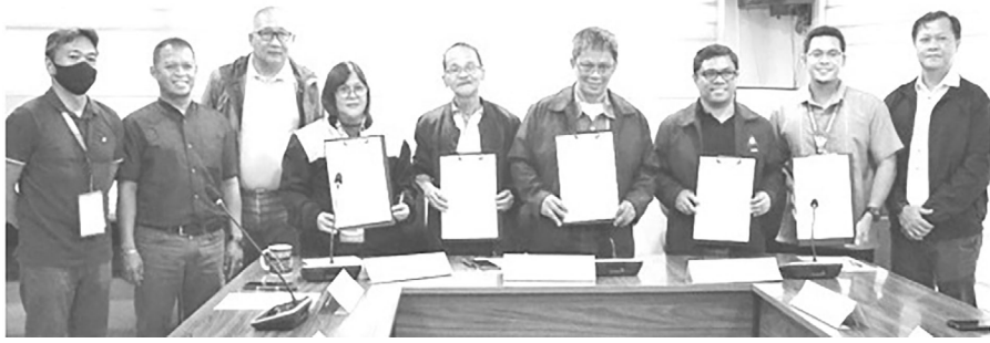
MOA Signing between DENR CALABARZON and DOLE Region No. IV-A for the Implementation of Tulong Panghanapbuhay sa Ating Displaced/Disadvantage Workers (TUPAD) Program last June 27, 2023

The Department of Environment and Natural Resources (DENR) CALABARZON signed a Memorandum of Agreement with the Department of Labor and Employment (DOLE) Region No. IV-A for the implementation of “Tulong Panghanapbuhay sa Ating Displaced/Disadvantage Workers (TUPAD) Program” last June 27 at the DENR CALABARZON Regional Office, Brgy. Mayapa, Calamba City, Laguna.