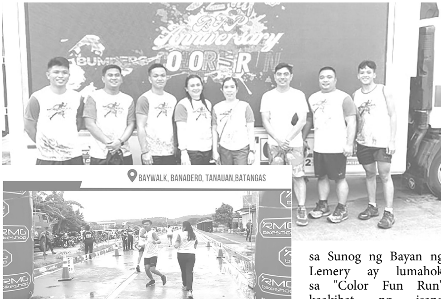
BAYWALK, BANADERO, TANAUAN, BATANGAS