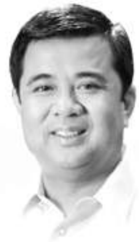
Mayor Alex "AA" Advincula Imus City, Cavite