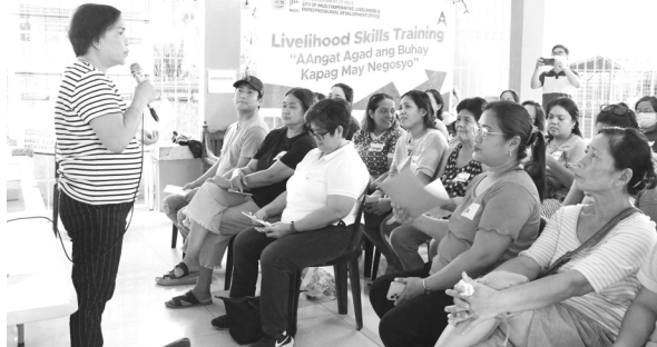
makapaghanap ng bagong trabaho.