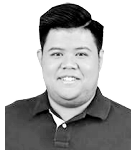
Cong. Adrian Jay 'AJ' Advincula 3rd District of Cavite