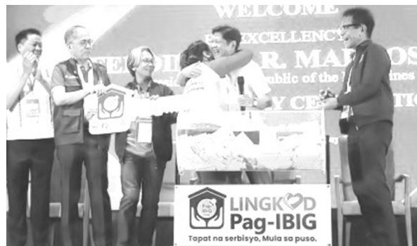
FREE HOUSE & LOT. One of the five winners of the socialized house and lot packages hugs President Ferdinand R. Marcos Jr. after receiving the symbolic key during the awarding ceremony at SMX Convention Center in Pasay City on Sunday (April 30, 2023). The event was one in a series of activities that kicked off the 121st Labor Day celebrations.