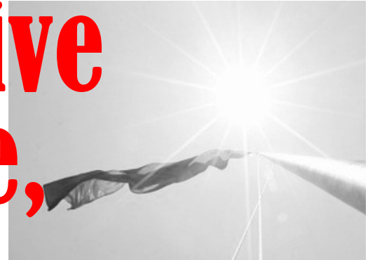
A giant Philippine flag flown at the Shrine of the National Flag of the Philippines in Alapan Imus, Cavite.

MANILA – President Ferdinand R. Marcos Jr. on Sunday enjoined Filipinos to join hands in creating a more “humane, fair and progressive” society.