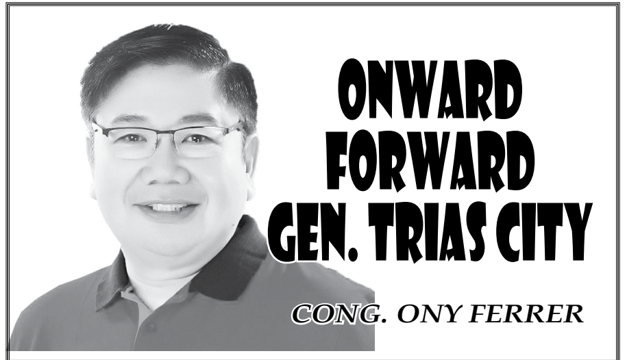
CONG. ONY FERRER

The help of the government on this kind of program will encourage further the interest of the cause-oriented groups