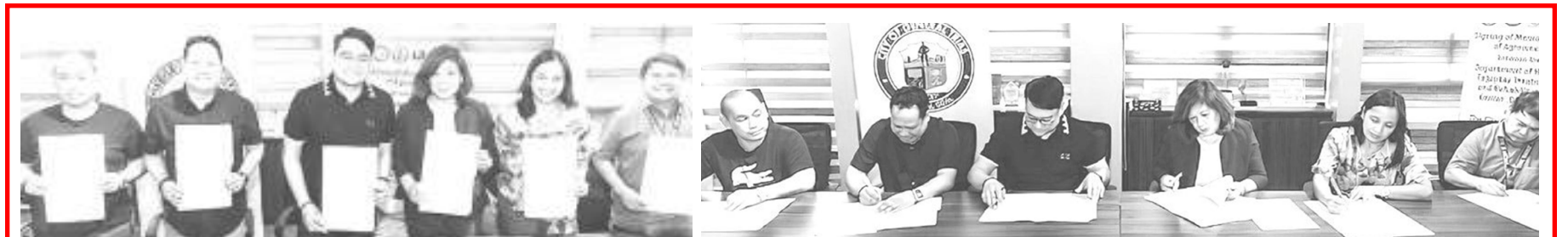
Nilagdaan ang kasunduan sa pagitan ng Pamahalaang Lungsod ng General Trias sa pangunguna nila Mayor Jon-Jon Ferrer, Vice-Mayor Jonas Labuguen at SP Members, at ng Department of Health Tagaytay Treatment and Rehabilitation Center (DOH-TRC) bilang bahagi ng programa ng City Anti-Drug Abuse Council (CADAC). (City Government of General Trias)