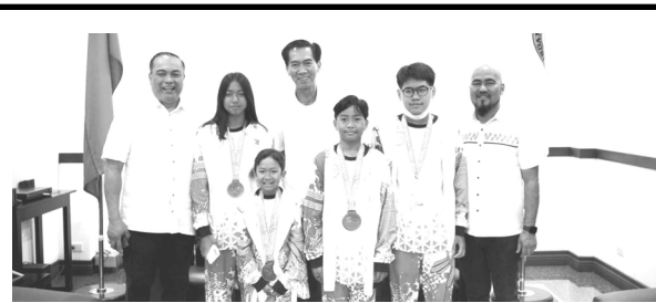
Kabataang Indangueños humakot ng parangal sa katatapos lamang na Asian Open Schools International Aquatics Championship na ginanap sa Bangkok, Thailand.