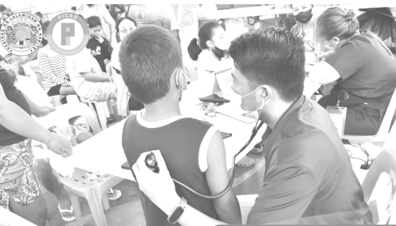
TAPAT SA BAYAN, TAPAT SA USAPAN. MEDICAL MISSION | MARCH 3, 2023 | CITY OF DASMARIÑAS WWW.CAVITE.GOV.PH - WWW.JONVICREMILLON.COM PROVINCIAL INFORMATION AND COMMUNITY AFFAIRS DEPARTMENT