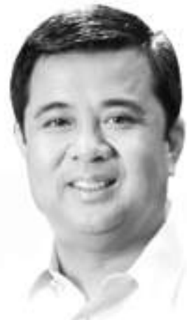
Mayor Alex “AA” Advincula Imus City, Cavite