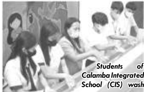
Students of Calamba Integrated School (CIS) wash their hands at the new hand washing station from SM Foundation and UNIQLO.