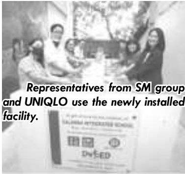
Representatives from SM group and UNIQLO use the newly installed facility.