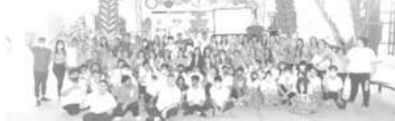
Students, staff, and teachers of CIS, UNIQLO representatives, SM malls employee volunteers, and SM Foundation representatives come together for a photo opt to cap the celebration.

In another collaboration for social good, SM Foundation, Inc. (SMFI) and UNIQLO Philippines simultaneously turned over new handwashing through the BalikEskwela Program last January 24, 2023. Advocating hand hygiene and safe resumption of in-person classes, the initiative commenced on December 6, 2022 in 10 schools: Caritan Norte Elementary School in Tuguegarao, Joaquin Smith Elementary School in Baguio, Masamat Elementary School in Pampanga, San Vicente Elementary School in Angono, Calamba