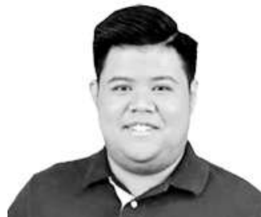
Cong. Adrian Jay 'AJ' Advincula 3rd District of Cavite