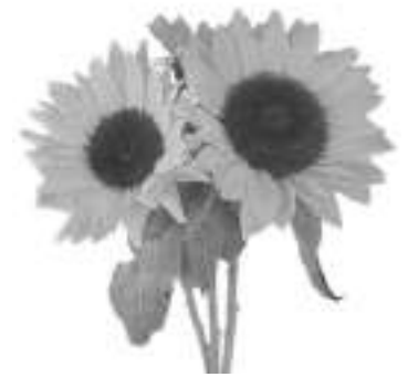
Scientific name: Helianthus annuus Common name: Mirasol (Tagalog); Sun Flower (Ingles)

Ang mirasol, o mas kilala sa pangalang sunflower, ay isang namumulaklak na halaman na kilalang-kilala ng halos lahat. Ito ay tumutubo na patayo, at bibihirang may sanga, at kalimitang may iisang bulaklak sa dulo. Ang dilaw na bulaklak ay mistulang araw kung kaya't tinatwag ito na sunflower. Ang mga dahon ay may balahibo malapad at may tusok-tusok na gilid. Sa ibang lugar, ang sunflower ay tinatanim at inaani para sa mga buto nito na maaaring kainin.