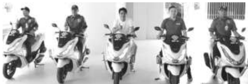
Guarding the city: The City Government of Bacoor headed by Mayor Strike Revilla together with Bacoor PNP led by Lt. Col. Ruther D. Saquilayan met with the PNP PRO4A headed by RD Police Brigadier General Jose Melencio C. Nartatez Jr. represented by PD Police Col. Christopher Olazo. During the meeting, the proper implementation of the PRO4A Action plan was discussed and important issues were also shared about increasing the safety of the people of Bacoor. Mayor Strike Revilla also gave five (5) motorcycle units to the Bacoor PNP to be used with their peacekeeping and patrolling duties. (RF/City Government of Bacoor)PIA CAVITE

The World Bank-funded SPLIT project aims to improve land tenure security and stabilize the property rights of some 1.14 million ARBs nationwide covering 1.37 million hectares of land, by subdividing the previously distributed CCLOAs, and turning them into individual land titles for distribution to qualified ARBs. (PNA)