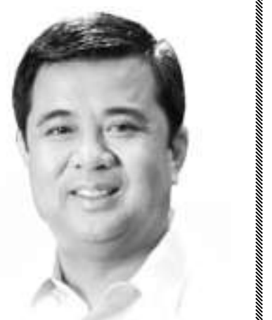
Mayor Alex "AA" Advincula Imus City, Cavite