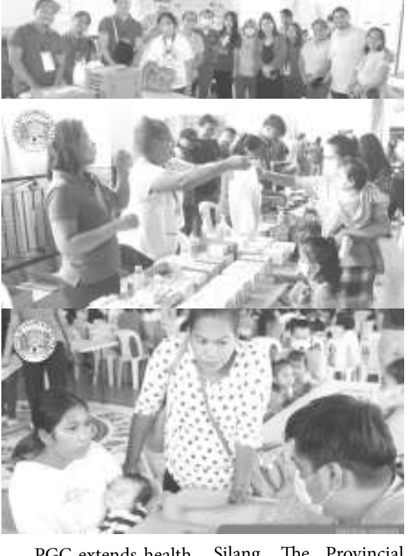
PGC extends health Silang. The Provincial services to the locals of Government of

Cavite's health services benefitted the locals of Silang in another round of medical mission held at Patio Medina, Poblacion 3 on January 24, 2023 serving a total of two hundred seventynine (279) patients.