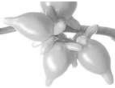
Scientific name: Solanum mammosum Linn.; Solanum mammosissium Ramrez Common name: Utong, Talong suso (Tagalog); Cow's udder, Apple of Sodom, Mickey mouse plant (Ingles)

Ang mickey mouse plant ay isang maliit lamang na halaman na may matitigas at makahoy na sanga at bahayang nababalot ng maliliit na tinik at buhok. Mas kilala ito bilang halamang ornamental dahil sa bunga nito na may kakaibang hugis. Ang bulaklak ay bahayang kulay lila na may pagka asul. Makikitang pananim sa mga gilid ng kalsada at bakanteng lote sa isla ng Mindanao, Sulu, at Leyte.