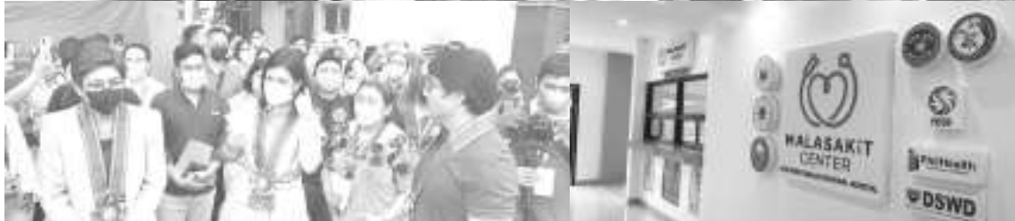
Opisyal na pinasinayaan nitong Enero 17 ng Department of Health (DOH) ang bagong tayong gusali ng Southern Tagalog Regional Hospital na matatagpuan sa lungsod ng Bacoor. Kasama sa naturang pagpapasinaya ang mga lokal na opisyal ng lungsod at mga kawani ng DOH.