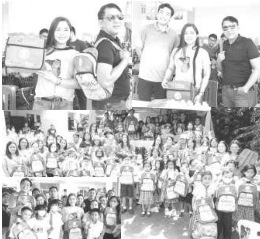
Be blessed, Be a blessing! Bagong Trece, Puso ng Cavite, Lungsod ng Pag Asa!

Kita kits po tayo sa mga susunod pang paaralan na ating bibisitahin.