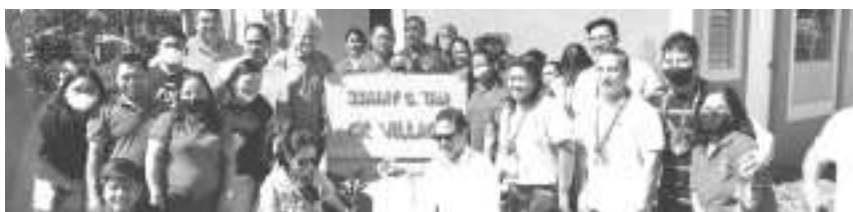
Pormal nang iginawad sa 20 pamilya ang kanilang mga bagong tahanan nitong Huwebes, Disyembre 15, sa Gawad Kalinga Village, Brgy. Alapan 2-B.

7. Kanser. Ang substansya na xanthonas na nakukuha mula sa balat ng kahoy, dahon at balat ng bunga ay mabisang laban mga tumor at cancer cells.