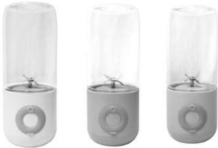
Add more grab-and-go items Make your always on-the-go friends live a healthier lifestyle by giving them functional yet easy-to-use Portable Juicer. It comes with a button panel multipurpose blender to make their own delicious juices, smoothies, or even milkshakes.