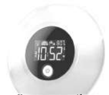
You may create a gift set together with a Bluetooth Speaker with Alarm Clock and LED Light for entertainment and function. It plays up to 10 hours and has a color changing light complete with a functional alarm clock.