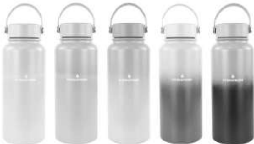
Another useful item you can give them this Christmas is a Hydrofresh Stainless Steel Tumbler. It comes in Ombre and Metallic collections which can also complete their daily fit because of its stylish looks.