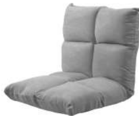
Put together a comfy nook Nothing beats useful items built for comfort and ease. Help your friends create a cozy corner at home with a Tatami Floor Chair that has breathable cotton fabric and high-quality cushion