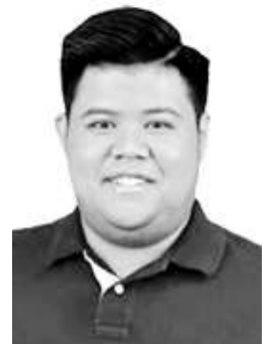
Mayor Alex "AA" Advincula Imus City, Cavite