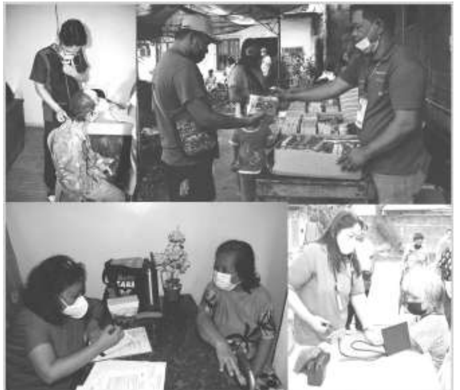
Medical services for the locals of Naic. As part of its intensive effort to deliver public health programs, OPG-Extension in partnership with the Provincial Health Office conducted another medical mission in Brgy. Sabang, Naic, Cavite on December 20, 2022.

to serve the people. Subsequently, Governor Jonvic Remulla laid out plans and various development programs of the province that will help uplift the lives of Caviteños.