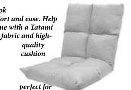
perfect for lounging. It also comes in various colors to match every personality.

Everyone is on their tail-end of holiday shopping! If you are thinking of completing your gifting list at the last minute, you may want your family and friends to receive thoughtful gifts and make them feel the Yuletide cheers.