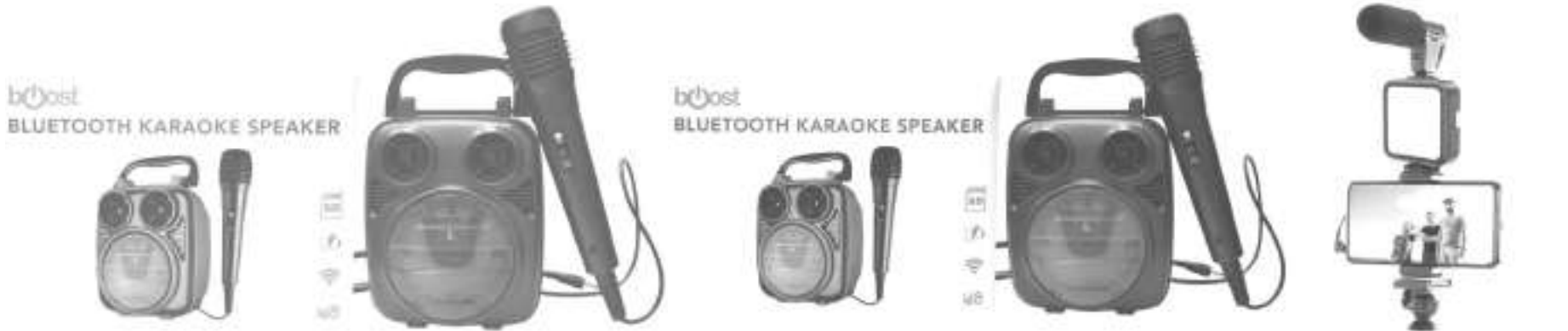
Make them the life of the party Surprise your fun-loving friends with a Bluetooth Karaoke with Microphone that they can use in every party. This one-of-a-kind Bluetooth Karaoke is easy to carry with its built-in handle, and to connect to other Bluetooth electronic devices for wireless audio link.