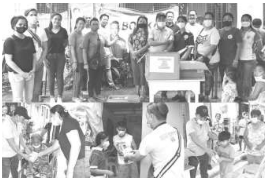
Botika on Wheels visited municipality of Naic. On October 28, 2022, the provincial government's Botika on Wheels once again rolled in Brgy. Calubcob, Naic, Cavite serving a total of 339 beneficiaries comprised of 123 adults and 216 children. BOW team was accompanied by barangay health workers and nutrition scholars in dispensing the medicines and vitamins. Safety health protocols were observed during the distribution.--- JDP(Cavite Provincial Information Office)

Asahan niyo po ang patuloy nating suporta sa mga programang makapagpapaunlad ng ating Bayan tulad nito.