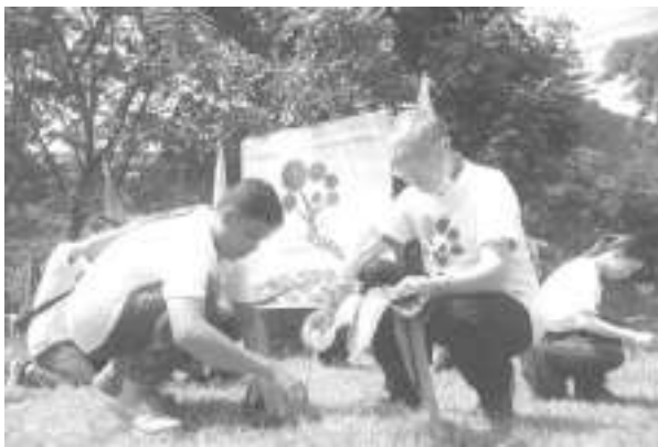
- Some 8,400 Palawan Cherry blossom trees locally known as 'balayong' and the bell-shaped Tabebuia pink flowering trees are being planted along the 7-kilometer Tarnate-Nasugbu road leading to Hamilo Coast.