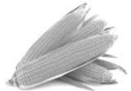
Scientific name: Zea mays L. Common name: Mais (Tagalog); Corn (Ingles)

Ang mais ay kilalang pananim sa mga bukirin sa Pilipinas na inaani para sa bunga nito na butil. Ang halamang mais ay isang uri ng damo na may taas na 1.5 hanggang 2 metro. Ang bunga ay may maputi o madilaw na mga butil na karaniwang ginagamit sa ilang mga produkto at pagkain. Ang mais ay