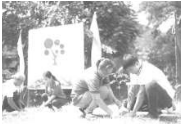
- Volunteers from SM Foundation and community members undertake the planting of flowering trees in Nasugbu

SM Foundation, Inc. the social good arm of the SM group, and the Fast Retailing Foundation (FR Foundation), a general incorporated foundation in Japan, formally launched the 'Grow Trees Community' project in Nasugbu, Batangas last September 27 as the first stop of three provinces for their 'treescaping' and reforestation initiative.