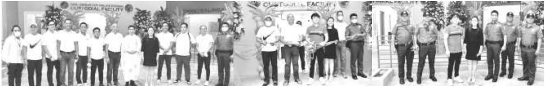
BLESSING & INAUGURATION of PNP Station and Bahay Kalinga located at Barangay Burot with Team Dasma to address the needs of children in conflict with law and strengthen the police force in the city.

ILAT - Ang Ilat ay lugar sa Tagaytay na isinunod sa ilat o maliit na ilog.