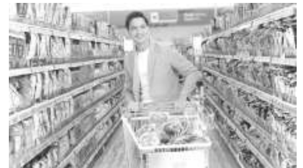
Love Convenience at WalterMart as it offers easy accessibility from parking to hassle-free shopping options thru curbside pick-up and ordering online.