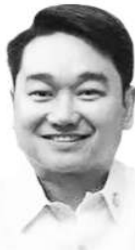
Mayor Jon-jon Ferrer Gen. Trias, City Cavite