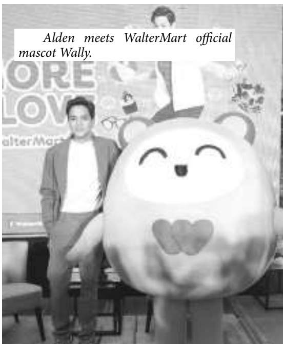
Alden meets WalterMart official mascot Wally.