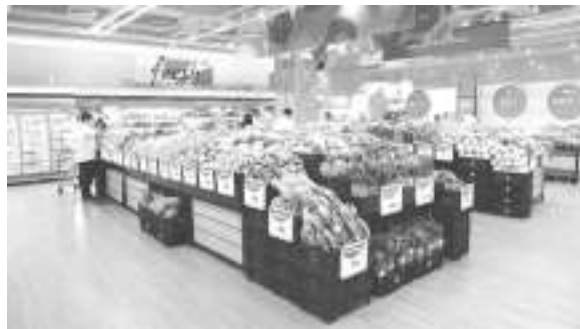
Alden shopping for groceries at WalterMart.