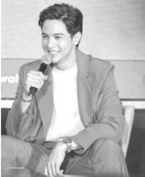
Alden Richards shares his love for WalterMart during the launch. “Noon pa lang avid goer naako ng WalterMart, kaya sobrang excited akomaging part ng WalterMart family”, he says. “Mahiligtalagaako mag shop especially for my family and mas naging exciting pa yan with this partnership.”