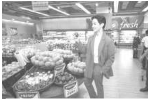
Asia’s Multimedia Star Alden at the WalterMart Supermarket fresh section.

Learn more about WalterMart’s More to Love campaign at https://www.youtube.com/(KCHT)