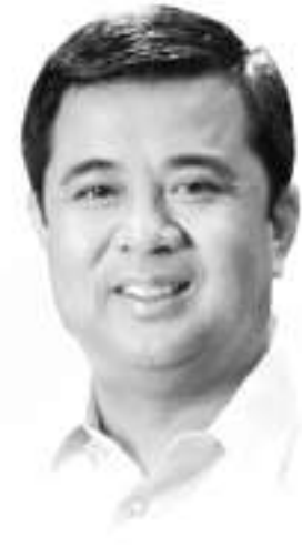
Mayor Alex "AA" Advincula Imus City, Cavite