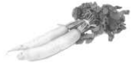
Scientific name: Raphanus sativus Linn. Common name: Labanos, Rabanos (Tagalog); Radish (Ingles)

Ang labanos, tulad ng karot, ay isang gulay na bungang ugat na kilalang-kilala ng mga Pilipino. Ito ay pahaba, kulay puti at may matapang na amoy. Ang halaman ay mababala lang at ang mga dahon ay bahagyang mabalalabo. Karaniwan itong makikita sa mga taniman sa buong bansa.