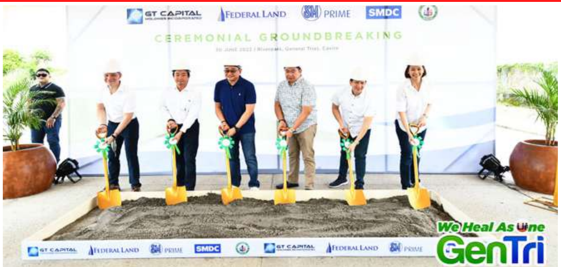
Isang Ceremonial Groundbreaking ng Riverpark General Trias ang ginanap nitong Hunyo 30 sa lungsod ng General Trias City. Ang naturang master-planned residential and commercial estate ay matatagpuan Barangay Pasong Camachile, na proyekto ng GT Capital Holdings at Federal Land, sa pakikipagtulungan ng SM Prime Holdings at SM Development Corporation.