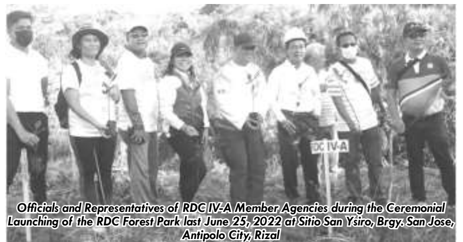
Officials and Representatives of RDC IV-A Member Agencies during the Ceremonial Launching of the RDC Forest Park last June 25, 2022 at Sitio San Ysiro, Brgy. San Jose, Antipolo City, Rizal

PATUTONG MALAKI - Ang Patutong Malaki, Tagaytay ay galing sa katagang "patuto" o "mohon" na boundary marking.