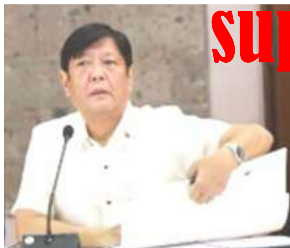
ENSURING FOOD SECURITY. President Ferdinand "Bongbong" Marcos Jr. leads the first executive meeting of the Department of Agriculture (DA) on Monday (July 4, 2022). He said his administration wants to secure a sufficient and affordable food supply for Filipinos.

MANILA – also concurrent secretary of the Department of Agriculture (DA), insisted President Ferdinand "Bongbong" Marcos Jr.,