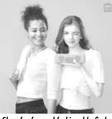
Shop for fun and fashionable finds at Miniso like this trendy wireless speakerand earn points and rewards while using the Wink Rewards Card.