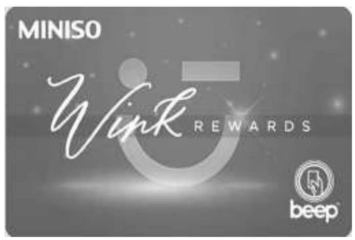
Shop and earn exciting perks and rewards with the Miniso Wink Rewards Card.

Japanese lifestyle retailer Miniso recently launched its Miniso Wink Rewards Card loyalty programwith lots of exciting perks and rewards. Now, there's more reason to check out and shop for Miniso's fun and fashionable finds.