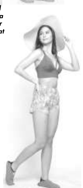
Chic red top, beach shorts and statement hat for those languid summer days.

Get beyond excited with the trendy and fun summer fashion collection at Surplus located in most SM Supermalls. For a more convenient shopping experience, you may check out Surplus at Lazada, Shopee, SM Malls Online, and ShopSM. Surplus Order to Deliver is also now available; join their Viber community and follow them on Facebook and Instagram @ SurplusPH and @Surplus_ph for more details.(KCHT)