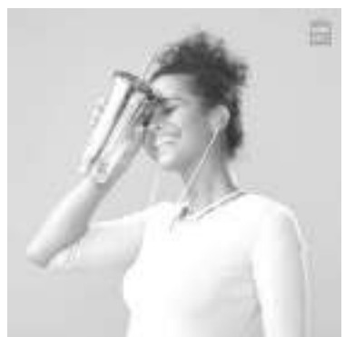
Check out and shop for fun and fashionable finds like this cool tumbler with straw at Miniso's life section.