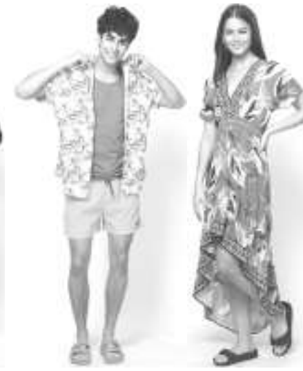
Printed polo and shorts for your next tropical adventure. Available at Surplus.