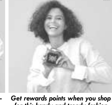
for this handy and trendy fashion speaker at Miniso