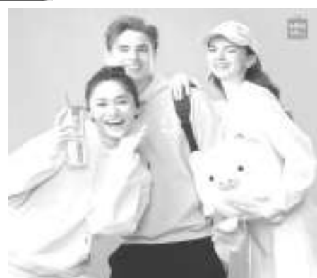
Conveniently shop for your favorite Miniso collectibles and earn points and rewards using your Miniso Wink Rewards Card.