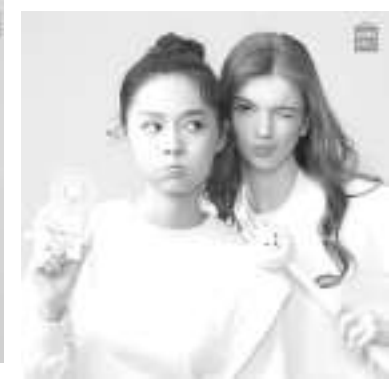
So many lovely items and giftables you can choose from when you visit