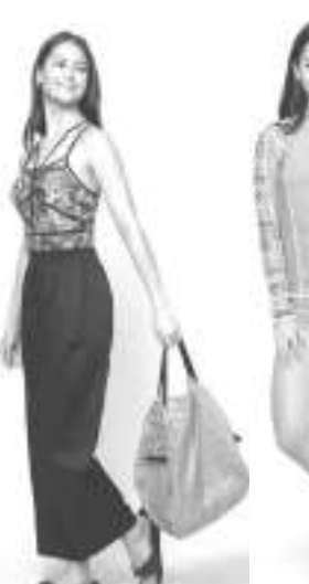
Stay cozy with Surplus sleeveless top, long pants and bag.