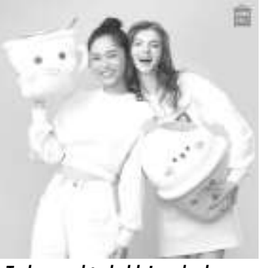
To hug and to hold. Lovely beverages pillow plushies available at Miniso.

The Wink Rewards Card can only be used at