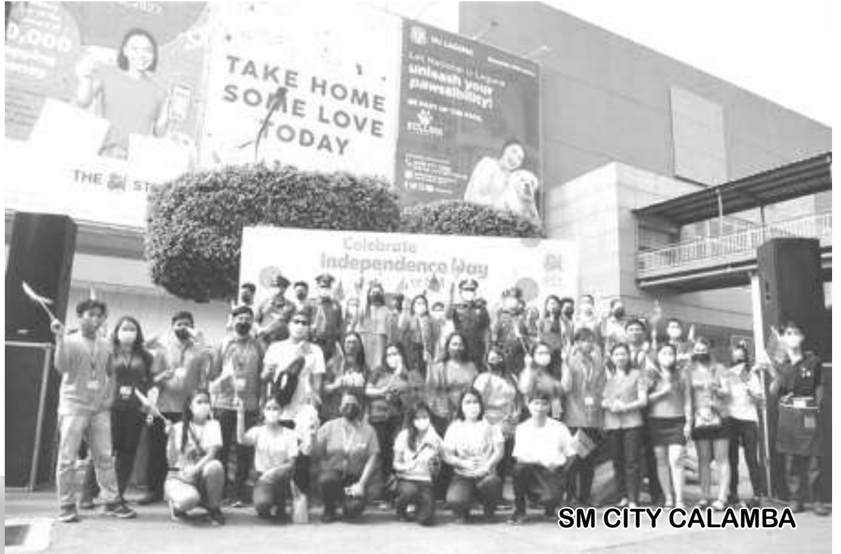
SM CITY CALAMBA

As part of the Independence Day celebration, "Pinoy Eats" and "Buy Pinoy" bazaars were also activated to give a complete Pinoy feel to the shoppers. (KCHT)