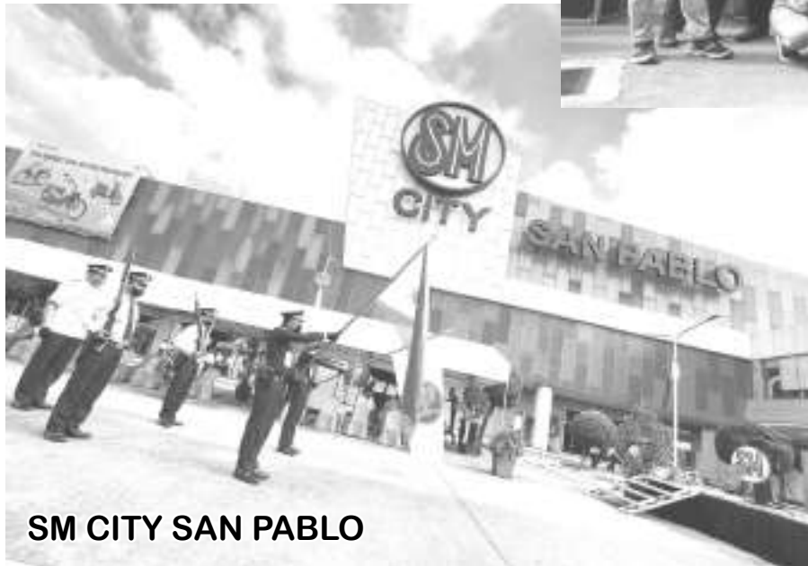
SM CITY SAN PABLO