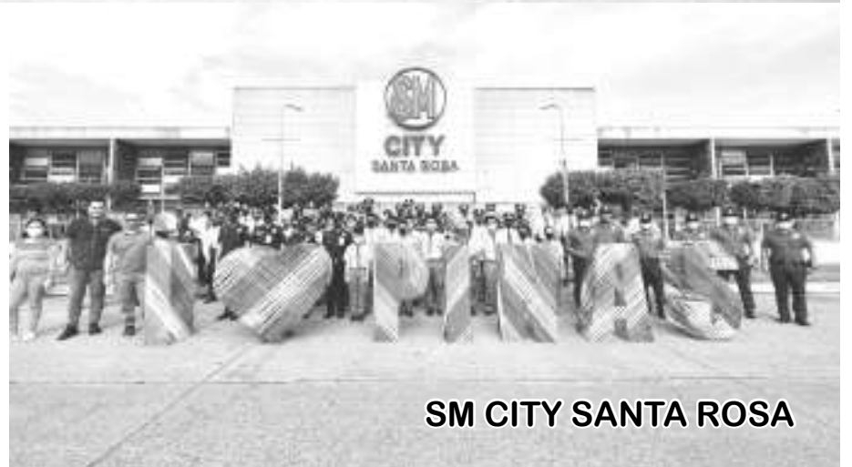
SM CITY SANTA ROSA