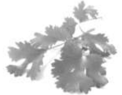
Scientific name: Coriandrum sativum Linn.; Coriandrum diversifolium Gilib.; Coriandrum globosum Salisb. Common name: Kulantro (Tagalog); Chinese Parsley , Cilantro , Coriander (Ingles)

8. Diabetes. Maaaring makatulong din ang regular na pag-inom ng pinaglagaan ng buto ng kulantro sa pagmementena ng asukal sa dugo sa mgataong may sakit na diabetes.