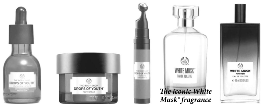
The Drops of Youth™ range is the perfect addition to your skincare routine for a smoother, supple and younger-looking skin.

was first launched in the Philippines will be going to its old price at 395 during the anniversary month. On top of that, The Body Shop's most loved products over the years such as Tea Tree range, Drops of Youth™ range and White Musk® fragrance collection will be offered at 25% OFF. (cont. P.7)