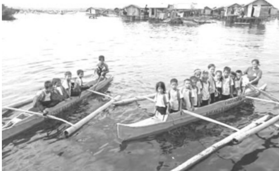
The partnership with Yellow Boat of Hope Foundation last 2019 helped fund boats which the children of Maluso, Basilan use as transportation to school.