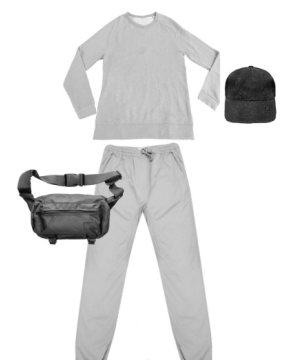
Lounge in style with neutral tones.