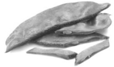
Scientific name: Dolichos lablab Linn.; Dolichos purpureus L. Common name: Bataw (Tagalog); Hyacinth Bean, Lablab bean (Ingles)

Pananakit ng sikhmura. Ang mga buto ay dapat kainin kung sakaling nakararanas ng pananakit ng sikhmura.