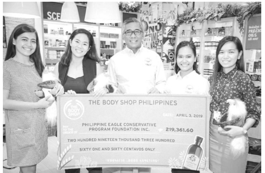
Last 2018, The Body Shop partnered with The Philippine Eagle Foundation to help protect our endangered Philippine Eagle and let them thrive and breed again.

British beauty brand The Body Shop marks another beautiful milestone as it celebrates its 25th anniversary in the Philippines. The brand, which introduced cruelty-free and nature-inspired skincare and bath and body treats to Filipinos when it first opened its doors on May 16, 1996 at SM Southmall, now has over 60 standalone stores, and is in 10 The SM Stores all over the country.