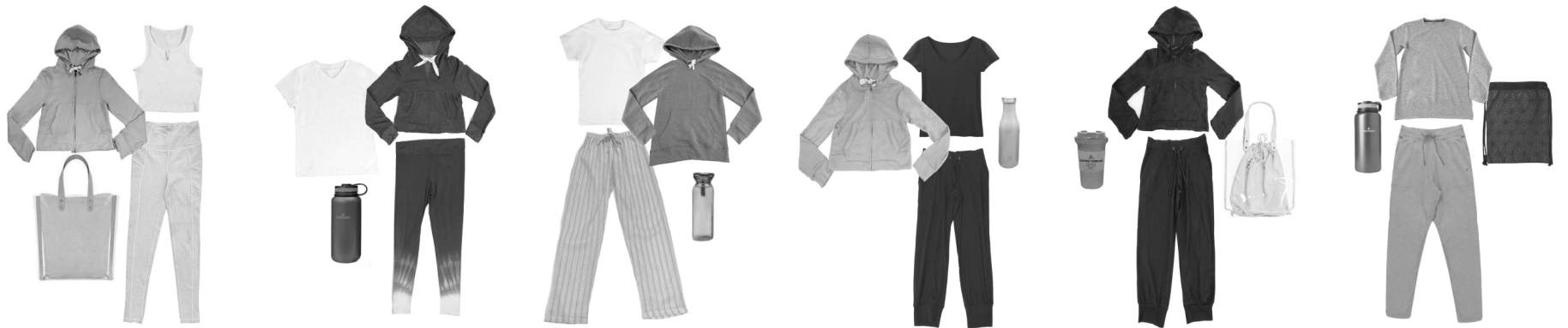
Energize your all-white ensemble with a pink hoodie and tote bag made of PVC material which is easy to disinfect after your outdoor errands.

As we shift into new lifestyles – WFH arrangements, online classes, zoom meetings, binge-watching our favorite series- loungewear has become a defining fashion staple in many of our wardrobes. And after a year, in elevated style, it has found its way in the spring/summer runways – track pants at Celine and sweat suits at Rodarte and Balenciaga.