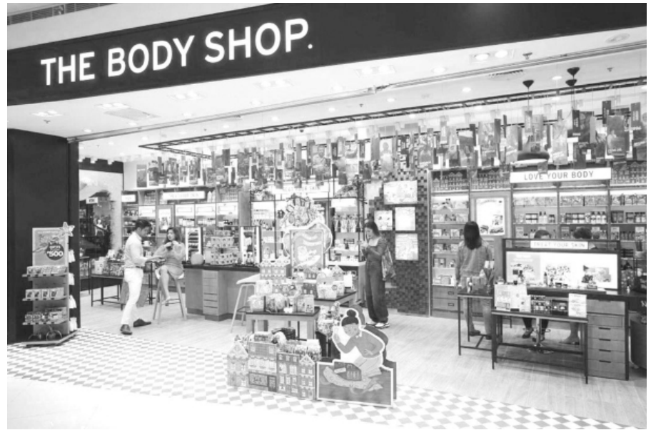
The Body Shop SM Mall of Asia showcases its latest store concept.