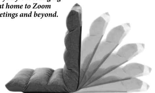
Comfortable, functional and adjustable Tatami Chairs are available in different colors.