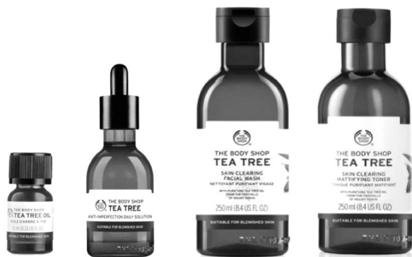
The Body Shop's Tea Tree range, which is perfect for oily and blemish-prone skin, is made with purifying Community Fair Trade tea tree oil from Kenya.

The Body Shop is more than a beauty brand – activism is in its DNA, and like its counterparts all over the world, Body Shop Philippines has participated in many campaigns which promote real change. With the support of its customers, help was extended to The Philippine Eagle Foundation in 2018,