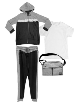
This hoodie and jogger pants combination will take you from lounging at home to Zoom meetings and beyond.