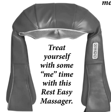
Treat yourself with some "me" time with this Rest Easy Massager.