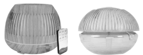
Get your much-needed pampering with this Wooden Aroma Humidifier and Wooden Air Revitalizer.