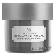
Draw out impurities and refine your pores with Himalayan Charcoal Purifying Glow Mask.

The sparkling scent of British Rose Eau de Toilette contains the essence of handpicked roses.