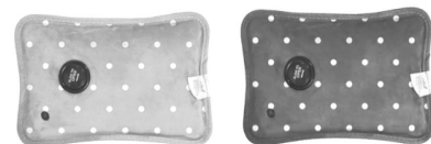
Relax and ease your muscle pain with this Rechargeable Hot Compress.