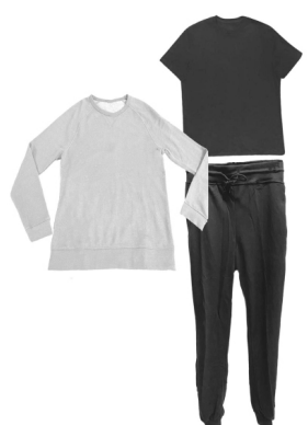
Upgrade your downtime with this khaki pullover and black coordinates.