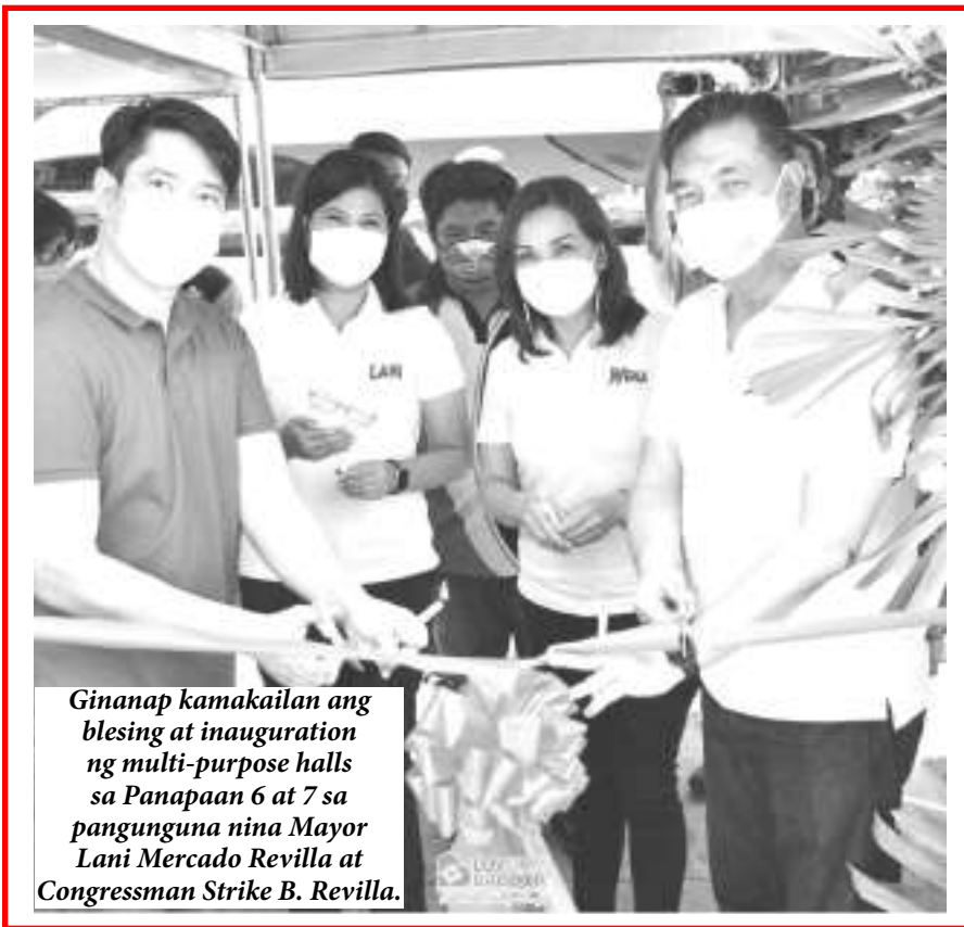
Ginanap kamakailan ang blessing at inauguration ng multi-purpose halls sa Panapaan 6 at 7 sa pangunguna nina Mayor Lani Mercado Revilla at Congressman Strike B. Revilla.