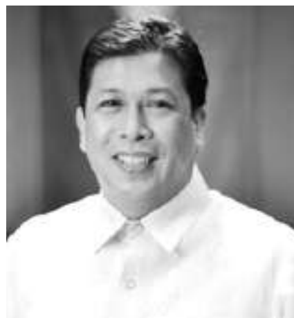
Vice Mayor Ony Cantimbuhan Imus City, Cavite