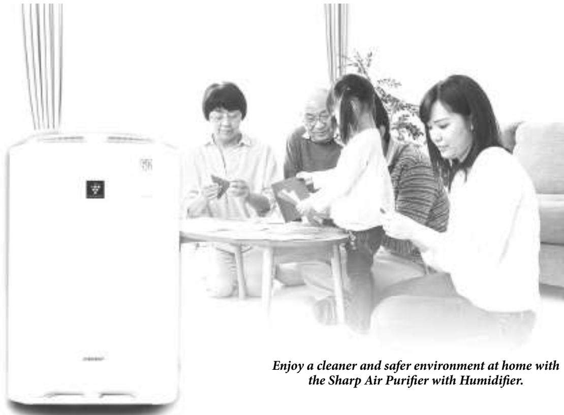
Enjoy a cleaner and safer environment at home with the Sharp Air Purifier with Humidifier.

As it helps more Filipinos transition to a digital home, SM Appliance Center offers customers a better, faster and easier way of shopping online through its newly revamped website, The New SM Appliance at www.smappliance.com . The new website layout is more intuitive and allows