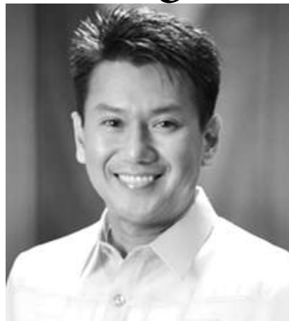
Mayor Emmanuel Maliksi Imus City, Cavite