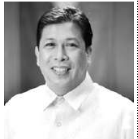
Vice Mayor Ony Cantimbuhan Imus City, Cavite