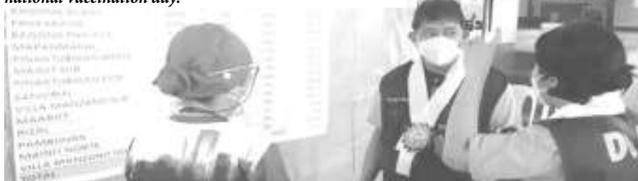
A n officer of the Bureau of Fire Protection administers an Aztrazenece vaccine to a resident of Alabat, Quezon.