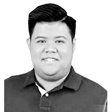
Vice Mayor Ony Cantimbuhan Imus City, Cavite