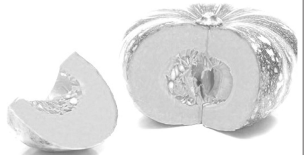
Scientific name: Cucurbita maxima Duchesne; Curcubita sulcata Blanco Common name: Kalabasa (Tagalog); Pumpkin, Squash (Ingles)

Ang halaman ng kalabasa ay gumagapang (vine) at nagbubunga ng bilugan at may madilaw na laman. Ito ay pinakakilala dahil sa bunga nito na karaniwang gulay sa bansa. Namumulaklak ito ng dilaw at madaling tumubo sa maraming maiinit na lugar kabilang na ang Pilipinas.