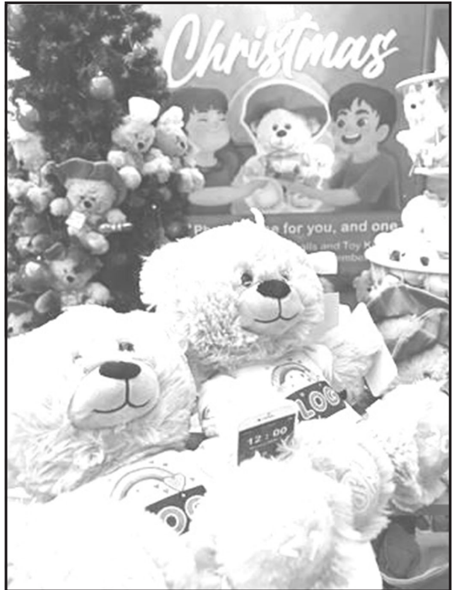
It's Cammy, the Vlogger Bear. Buy a bear for Php 250. Onr for you and one to donate. #SMBearsOfJoy

Humanity News November 15, 22 & 29, 2021