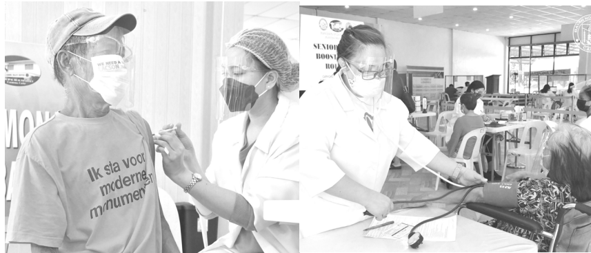
Sinimulan na ang pagbibigay ng COVID-19 booster shots sa senior citizens o mga miyembro ng A2 priority group sa pangunguna ng Municipal Health Office (MHO). Kung kayo ay kabilang sa A2 priority group at mahigit anim na buwan na mula nang nakatanggap ng second dose, makipag-ugnayan lamang sa inyong barangay.