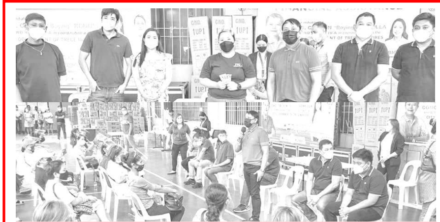
FINANCIAL ASSISTANCE Medical at Burial