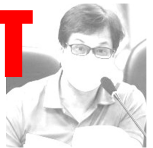
Metropolitan Manila Development Authority (MMDA) chair Benjamin "Benhur" Abalos Jr.

"Kung ito ay walang kasama na magulang o guardian, sisitahin ang mga bata, at of (cont. P.7)