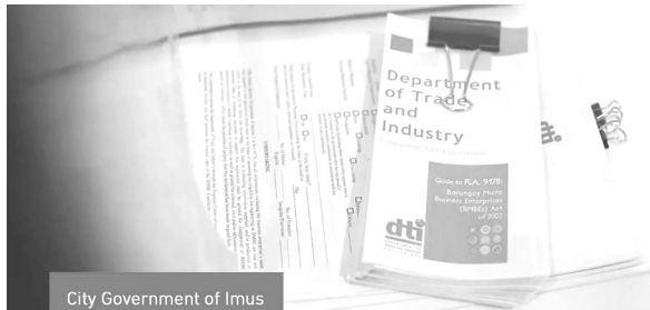
City Government of Imus

inilatag nito sa nagdaang taon, na bahagi ng mga inisyatibong maibalik ang sigla ng lokal na ekonomiya sa kabila ng pandemya.