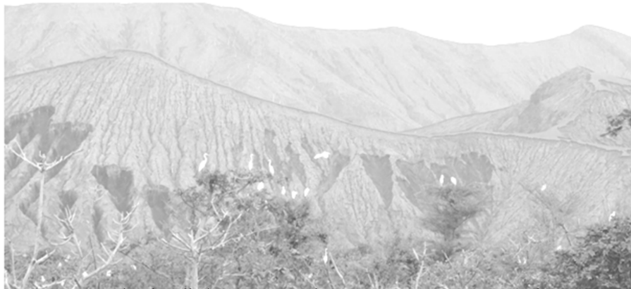
Great egrets ( Ardeaalba ) roosting on the remaining trees in Brgy. Alas-as, San Nicholas Batangas located within the Taal Volcano Protected Landscape