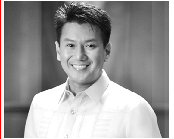
Mayor Emmanuel Maliksi Imus City, Cavite