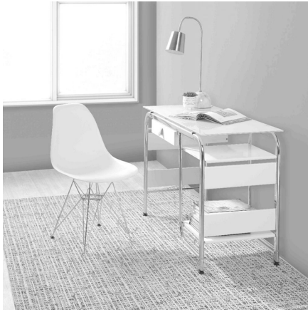
Glass, wood, and metal blend in beautifully in this thismodern contemporary designed white Havana Computer Desk.