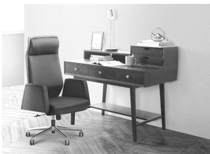
Classic Hambu Writing Desk in elegant dark wood finish has both open and pull-out drawers for a more organized work space.