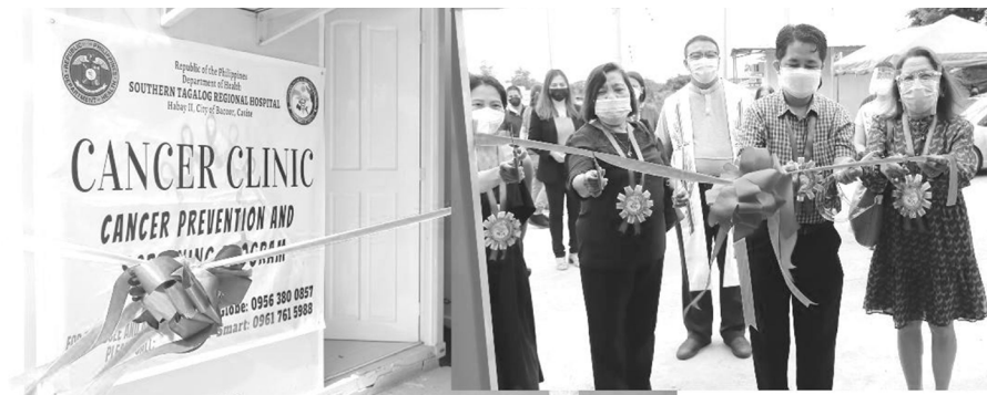
DOH-CALABARZON officials and provincial health officers of Cavite formally opens the Cancer Clinic at the Southern Tagalog Regional Hospital by cutting the ceremonial ribbon during the inauguration and blessing of additional new medical services held on August 6, 2021 in Bacoor, Cavite.

makapagbigay pa ng mas maraming serbisyo sa mga