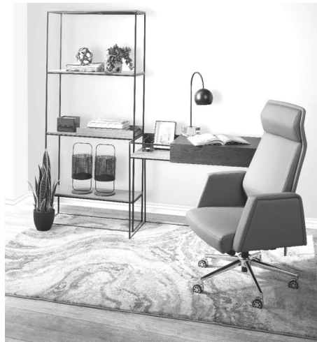
Our Home's Farkins Office / Study Desk has one side for writing and paper work, and another side for storage and décor.

After more than a year of working from home, it's time to indulge yourself by creating a working space that's both decorative and functional. And most likely, the desk will be the centerpiece of one's home office in terms of design and activity.