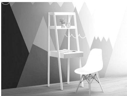
Double deck Scandinavian designed Janine IIDesk perfect for small spaces and for your kid's online classes.