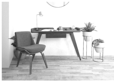
Create a streamlined workspace with this sleek and polished Gavin Office Desk