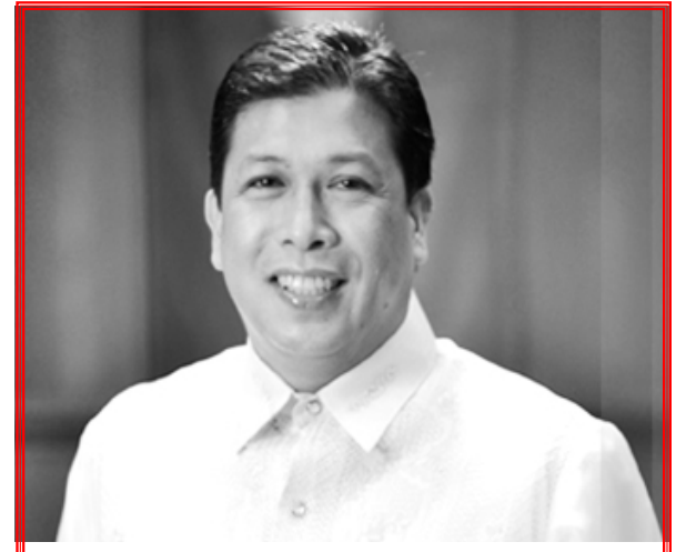
Vice Mayor Ony Cantimbuhan Imus City, Cavite