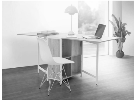
Compact drop-leaf Jacob Desk is easy to fold and easy to keep after a day's work. Perfect for smaller rooms or condos.