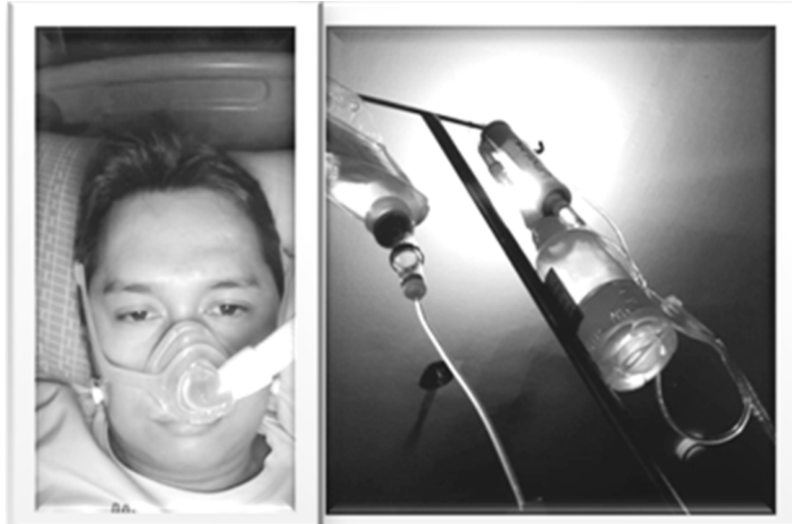
Kasama na sa isipin ang babayaran sa ospital, pero dahil sa benepisyo ng PhilHealth, agad mong mararamdaman ang financial risk protection.