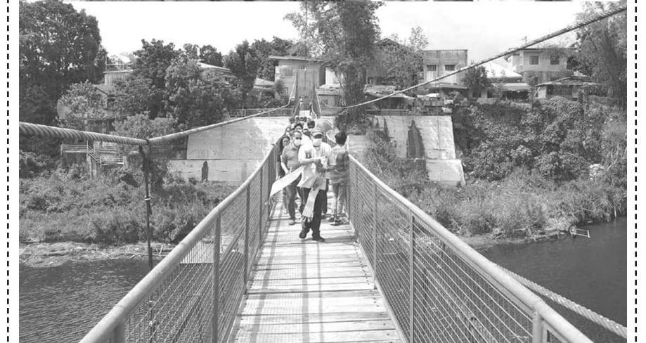
Opisyal ng binuksan ang Hanging Bridge na nag-uugnay sa Poblacion at Pinagsanhan sa Maragondon, Cavite.