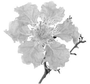
Scientific name: Lagerstroemia speciosa (L.) Pers.; Lagerstroemia reginae Roxb.; Munchausia speciosa (L.) Common name: Banaba (Tagalog), Queen's Flower o Pride of India (Ingles)

7. Impeksyon ng bacteria sa katawan. May ilang pag-aaral na ang pinaglagaan ng bunga ng banaba ay makatutulong sa pagpuksa ng impeksyon ng bacteria sa katawan.