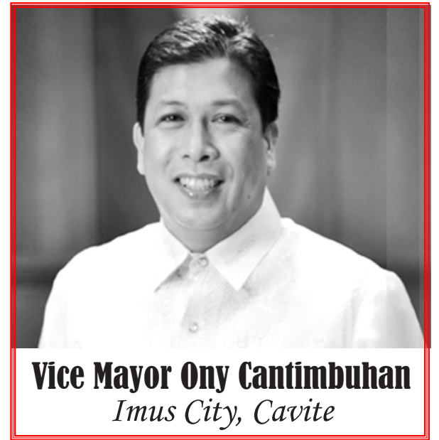
Vice Mayor Ony Cantimbuhan Imus City, Cavite

Vol. V No. 22 May 3-9, 2021 P 10.00 ISSN No.: 2672-3034