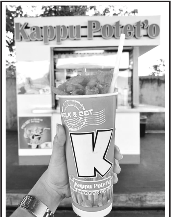
The #1 snack on the go ng bayan is here at SM City Calamba! Come and visit KappuPotet'o at the South Terminal Parking. (KCHT)