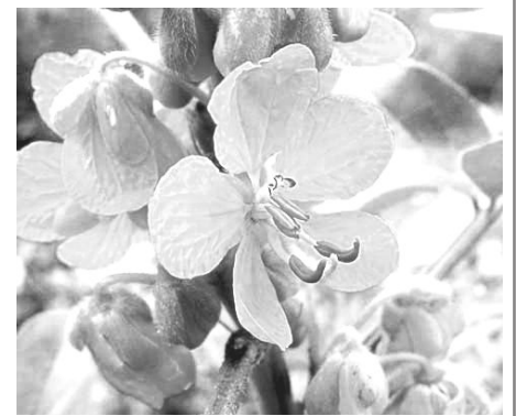
Scientific name: Cassia occidentalis Linn.; Senna occidentalis (L.) Common name: Balatong-aso (Tagalog); Coffee senna (Ingles)

Pagtitibi. makatutulong naman sa hirap sa pagdumi ang pag-inom din ng pinaglagaan ng halamang balatong-aso