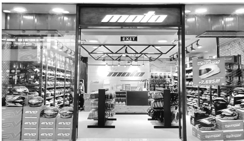
Ready to ride? For all your motorcycle accessory needs - from helmets, gloves, vests, and many more. Gear up with MOTO, now open at the 2nd Level near SM Foodcourt, SM City Calamba. (KCHT)