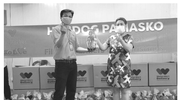
The Ateneo Center for Education (Tanging Yaman for Farmers) received Walmart donations of Handog Pamasko gift packs.

Check out the Handog Pamasko Thank you video link: http://bit.ly/2XaxjEz . For more updates, visit our facebook page @WalmartMallOfficial, @WalmartSupermarket or check our website at www.walmart.com.ph (KCHT)