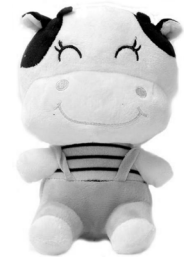
Ox boys like to play sports just like these cuddly toys in overalls from Toy Kingdom.