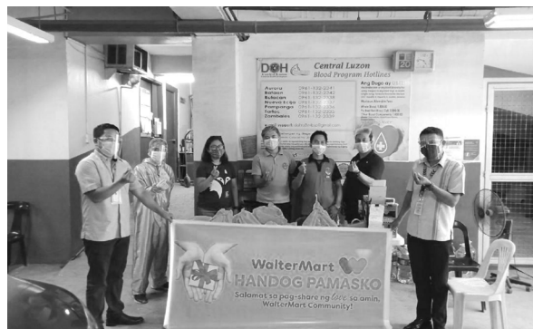
Walmart provides Handog Pamasko gift packs to medical frontliners of Bulacan Medical Mission Group Hospital (BMMG Hospital).