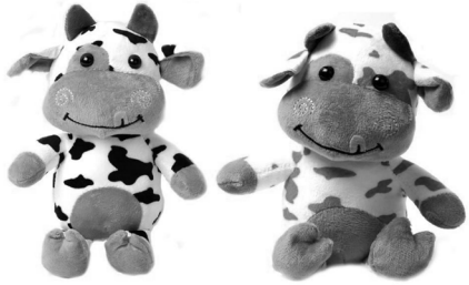
Welcome the Chinese New Year with lots of luck and fun with these speckled oxen inspired plushies from Toy Kingdom.