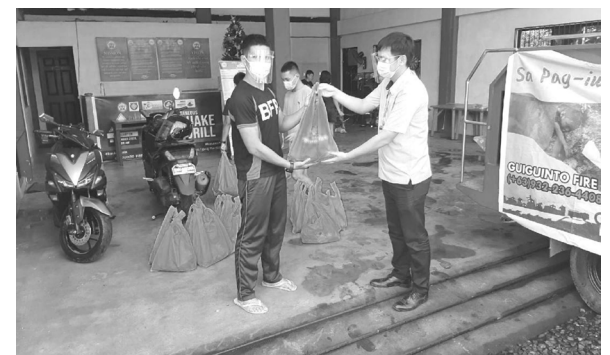
Walmart donated Handog Pamasko gift packs to Bureau of Fire Protection (BFP) of