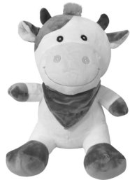
Let this cute ox plush toy from Toy Kingdom be your friend this Chinese New Year.

Ox children are distinguished by their endurance and diligence. It seems that there are no obstacles for them. Silent and purposeful, they amaze us with their responsible approach to the smallest task.