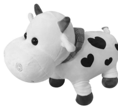
Feel the luck and love with this ox plush toy with heart shaped dots.