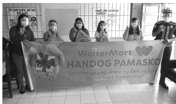
Plaridel Central School teachers were delighted to receive Walmart's Handog Pamasko gift packs.