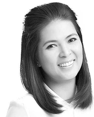
Mayor Lani M. Revilla Bacoar, Cavite