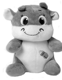
The ox girl is sweet in disposition just like these pastel colored stuffed toys.