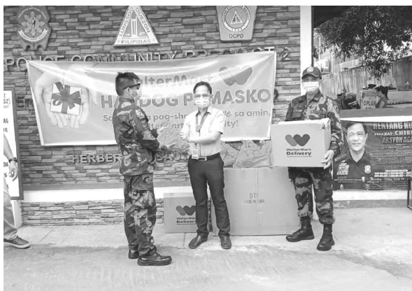
Walmart turns over its Handog Pamasko gift pack donations to the Philippine National Police (PNP) in Baler Station.