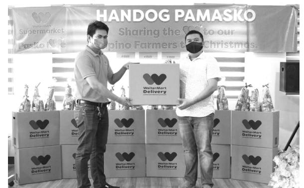
Walmart donations of Handog Pamasko gift packs to San Jose Farmers.

True to its commitment to be the friendly community hero, Walmart brings ultimate shopping convenience to customers every day in the new normal, as well as cheers to frontliners in its Handog Pamasko gift giving held recently in all Walmart Malls.