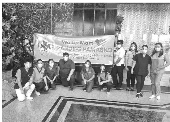
Gentri Medical Center and Hospital Inc. received Walmart's Handog Pamasko gift packs for their frontliners.