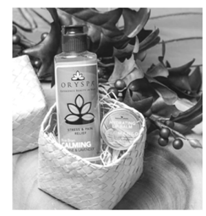
creations of weavers, farmers and workers from (cont. P.7)