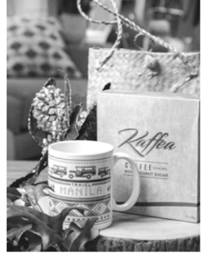
woven and wooden home accents made from locally sourced materials, proud