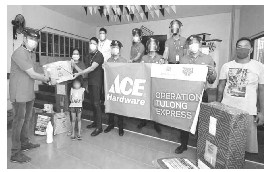
The ACE Hardware team turns over the donations to the residents of Kasiglahan Village Rodriguez Rizal with SM Foundation and DSWD.

While the series typhoons late last year have gone, many of those severely affected are still trying to rebuild their lives. To help fast-track recovery, ACE Hardware staff recently donated needed items such as bed & mats, PPEs, and cleaning materials to affected residents of Kasiglahan Village in Rodriguez, Rizal. This activity was done jointly with SM Foundation and the local DSWD chapter.