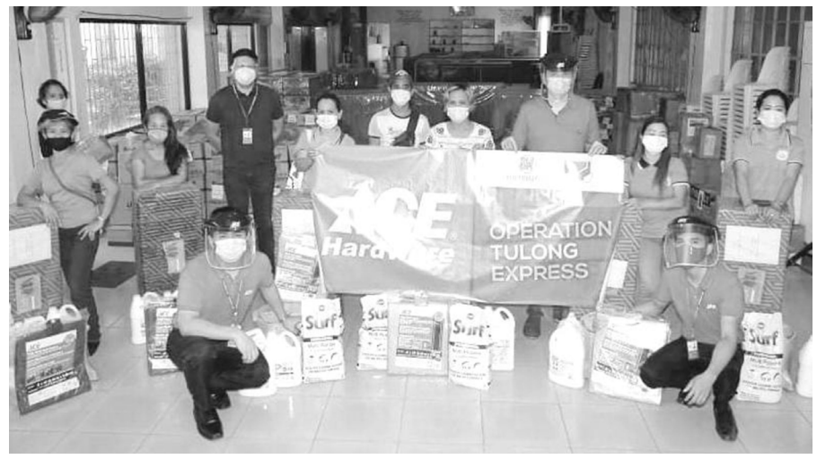
The Kasiglahan Village residents received donations of beds, matts, cleaning materials and PPE's from ACE Hardware that will help them rebuild their homes and keep their families safe from Covid-19 pandemic.